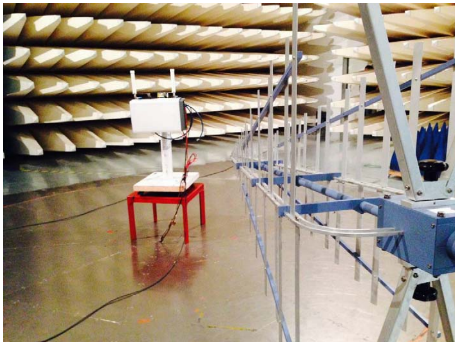
Semi-integrated Omni antenna KRE 101 2245/1, side mounted