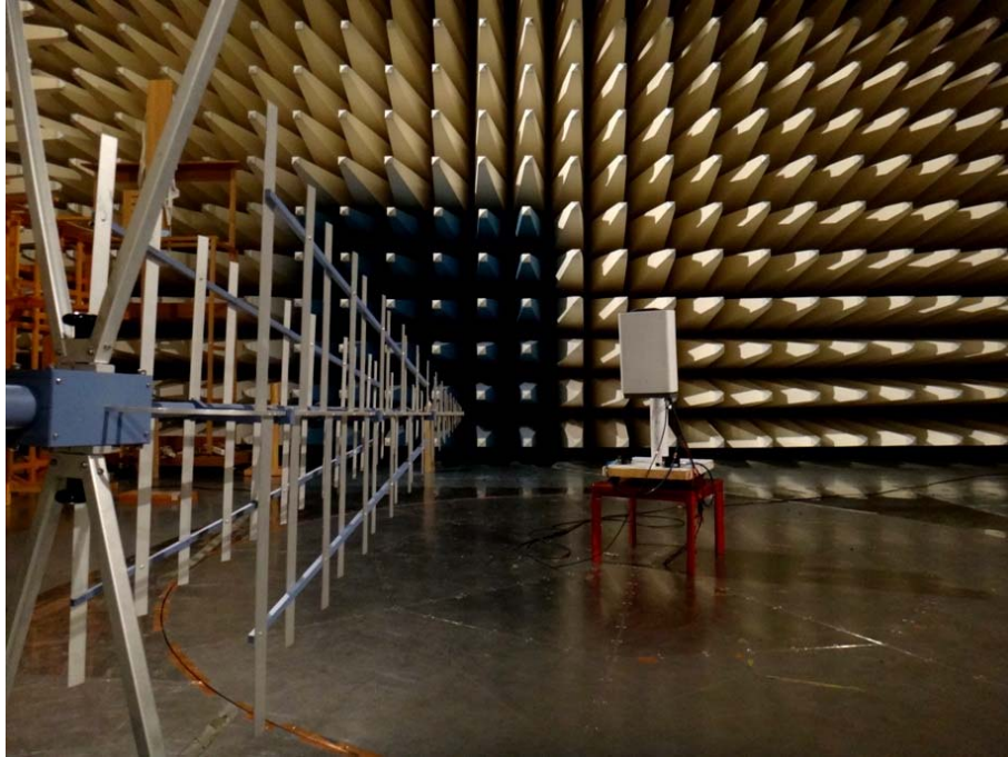
Radiated Emissions (30MHz – 3GHz)