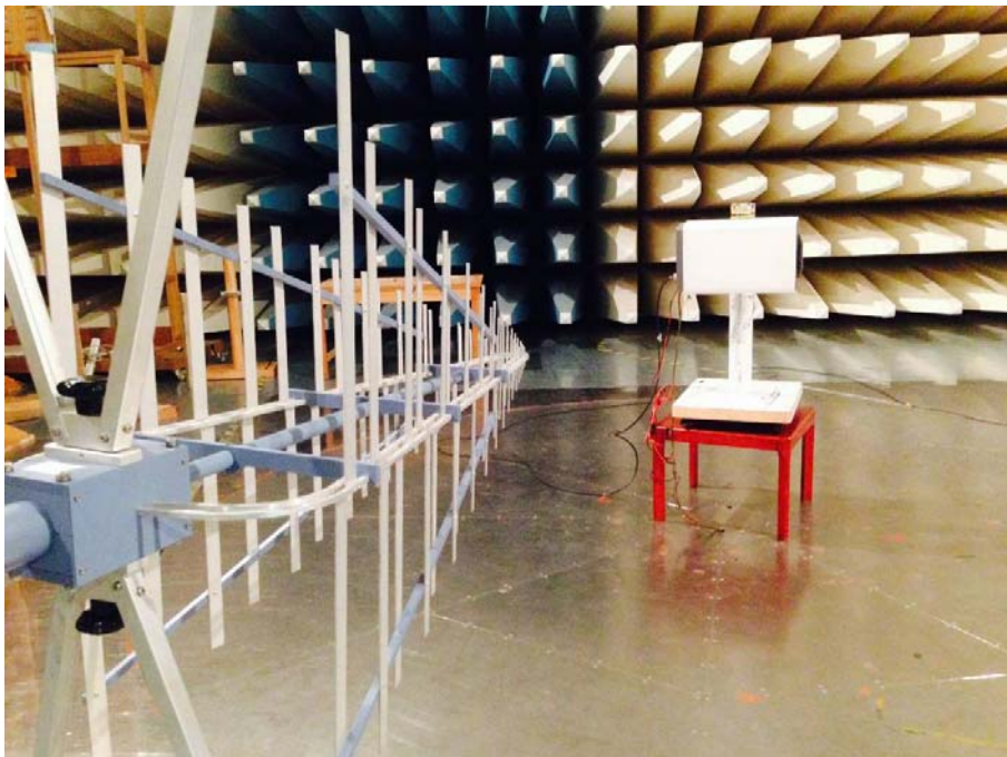
Integrated antenna KRE 101 2134/1, side mounted