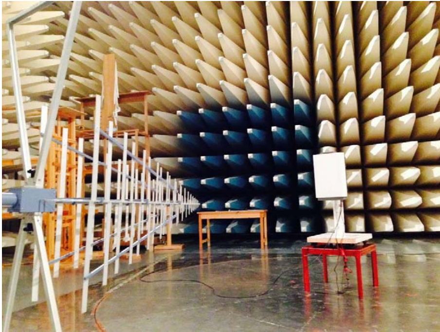
Integrated antenna KRE 101 2134/1, upright mounted