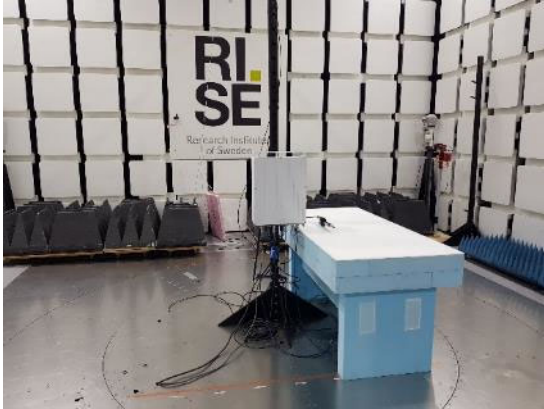
Test setup 30-1000 MHz: