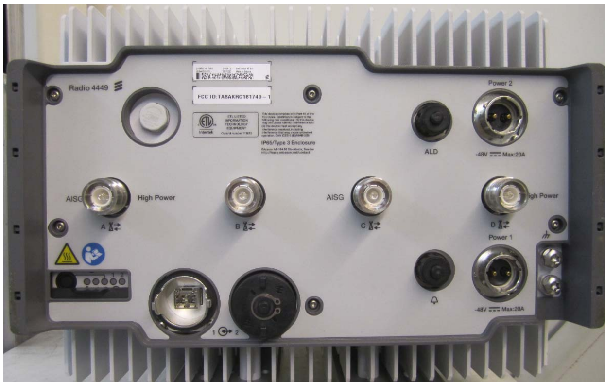
Figure 2: Radio 4449 B5 B13 Bottom / Connector View