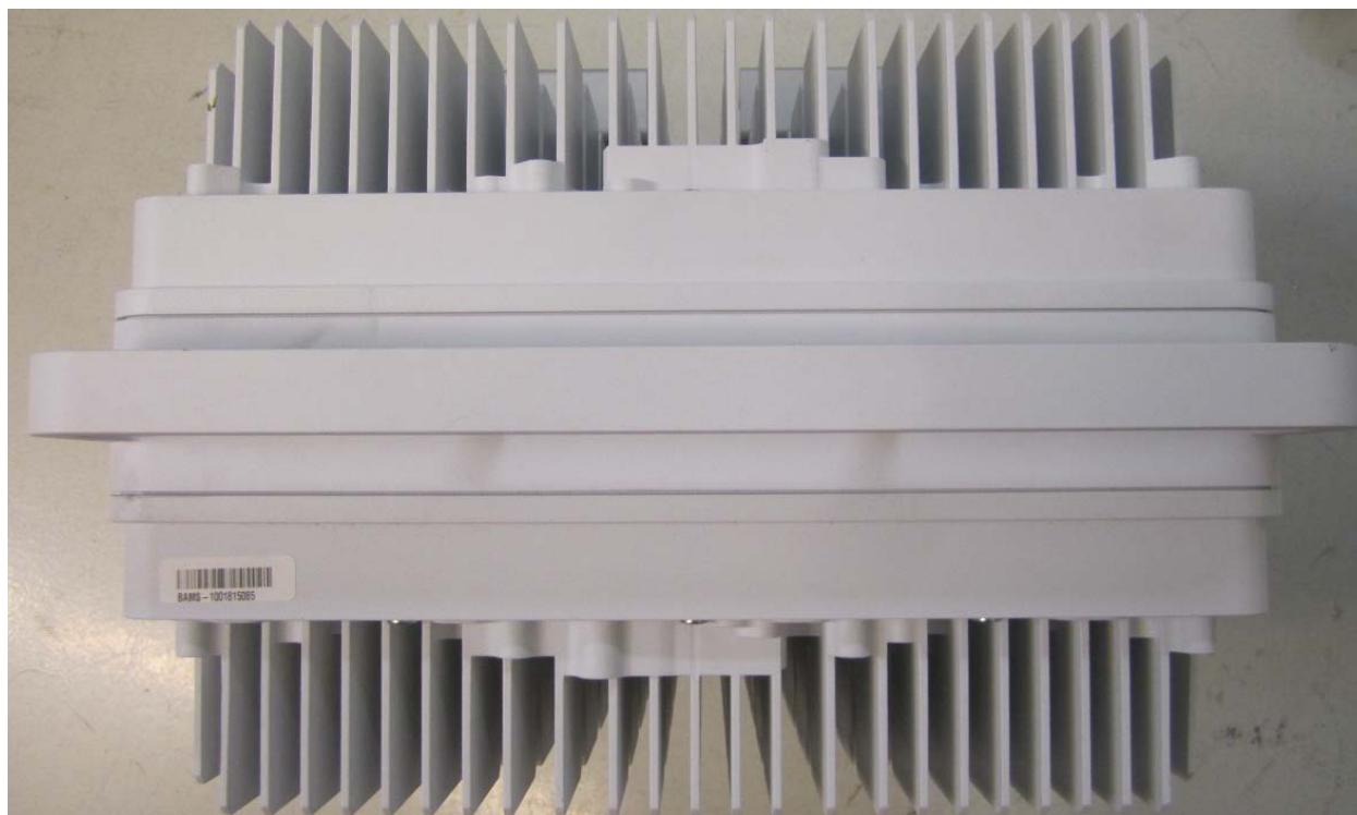
Figure 1: Radio 4449 B5 B13 Top View