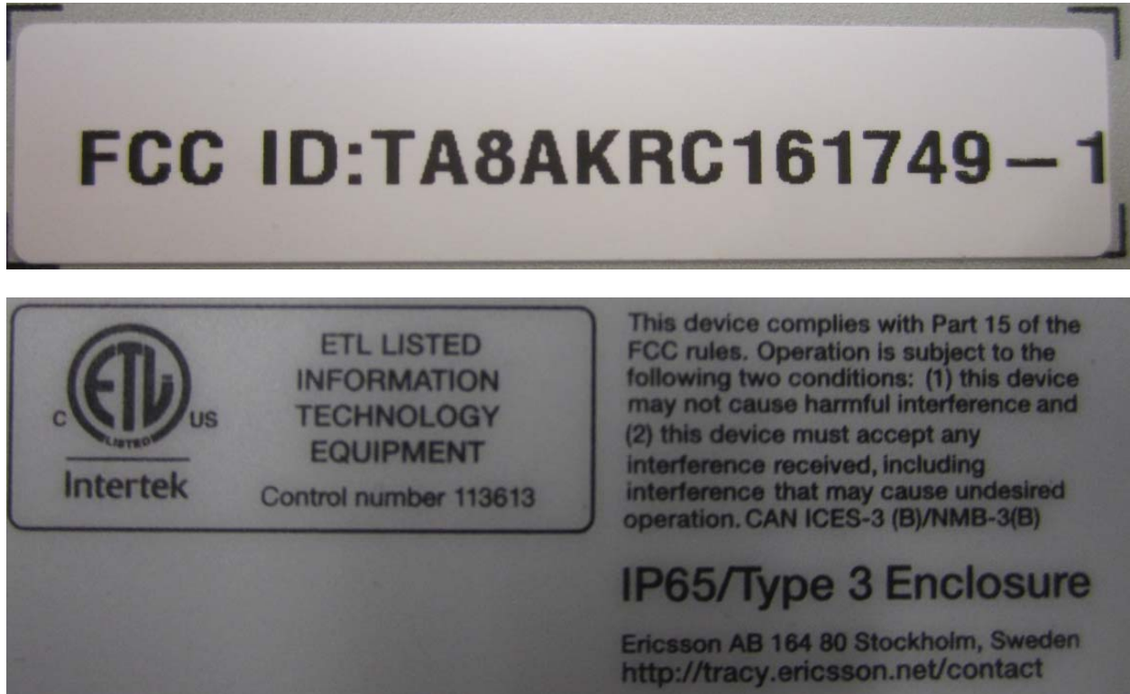
Label: Legal ID Radio 4449 B5 B13