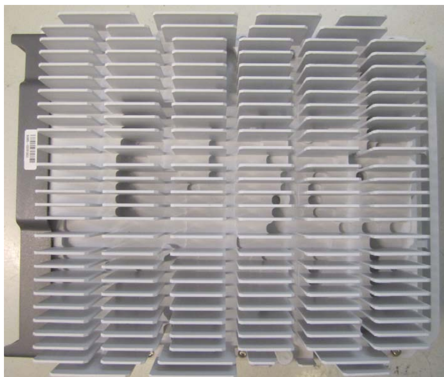
Figure 4: Radio 4449 B5 B13 Front View