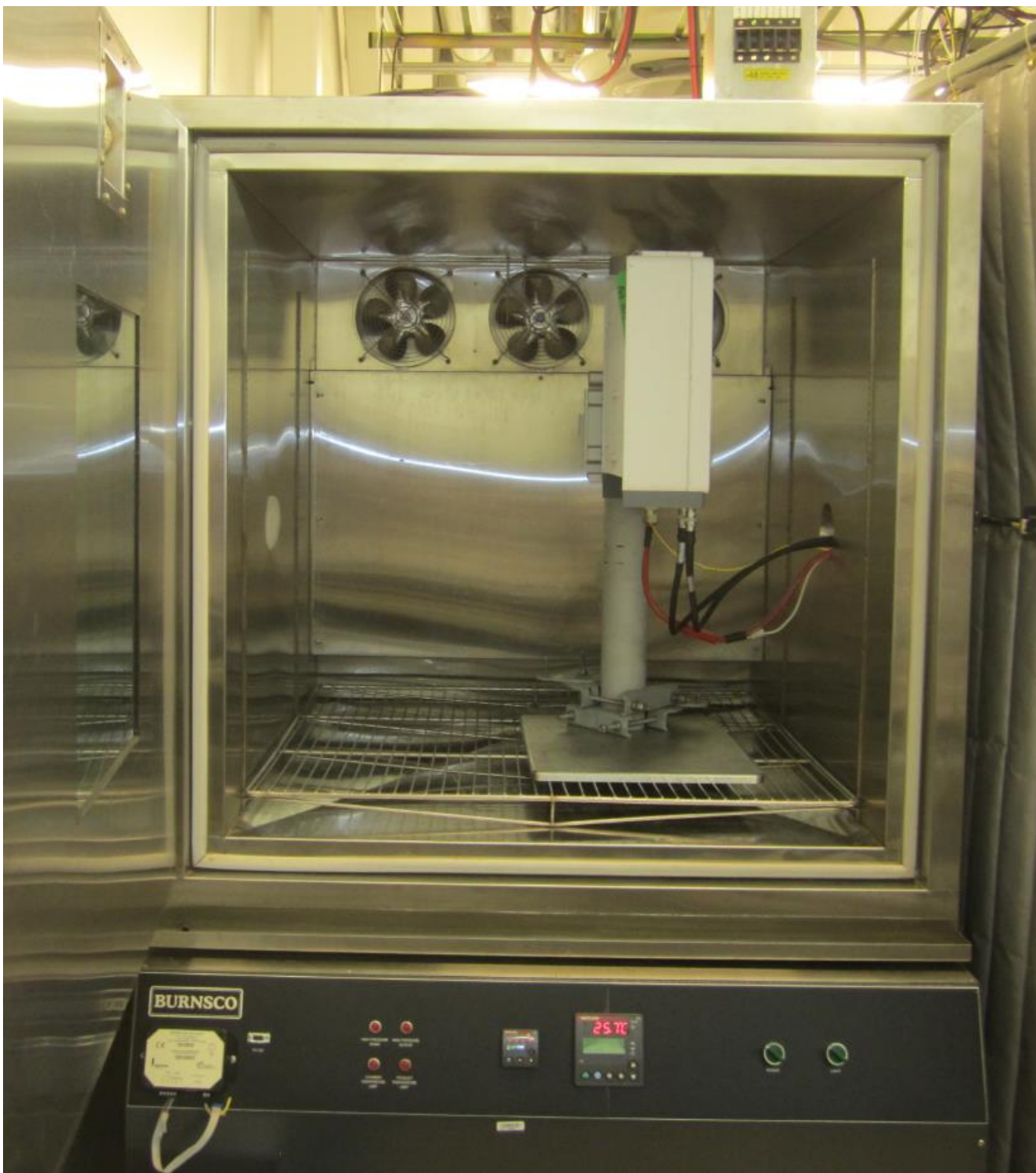
EUT Set-up for Radio Compliance Testing