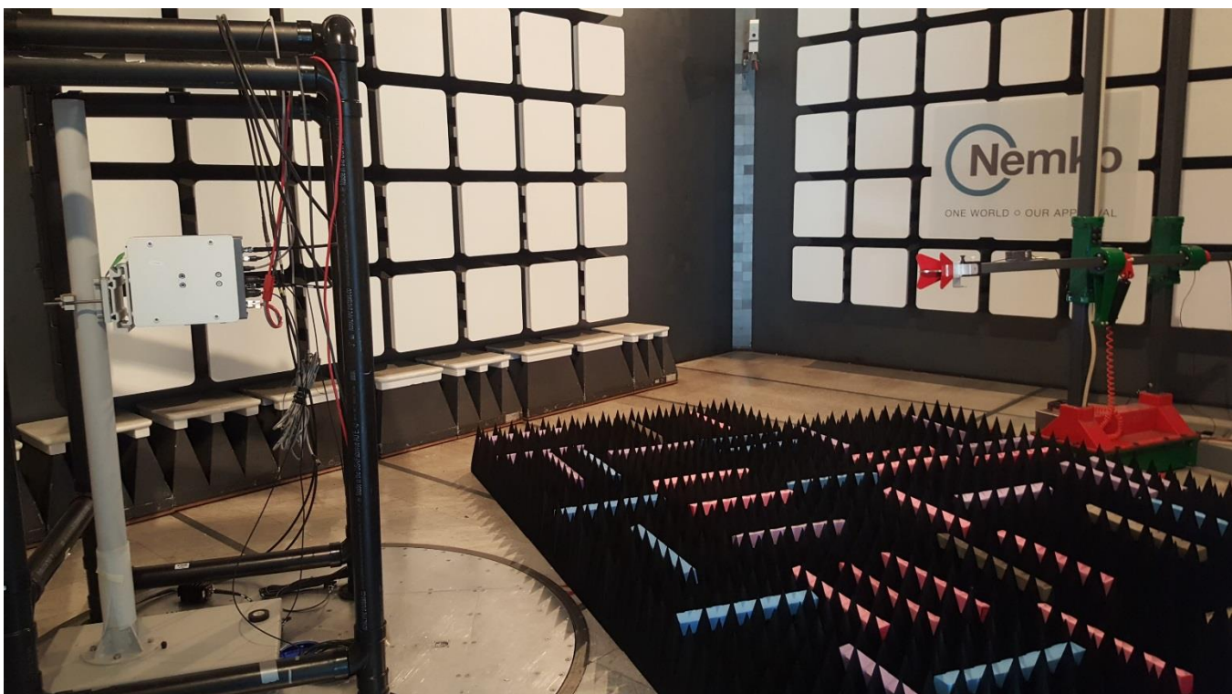
EUT Set-up for Radiated Compliance Testing