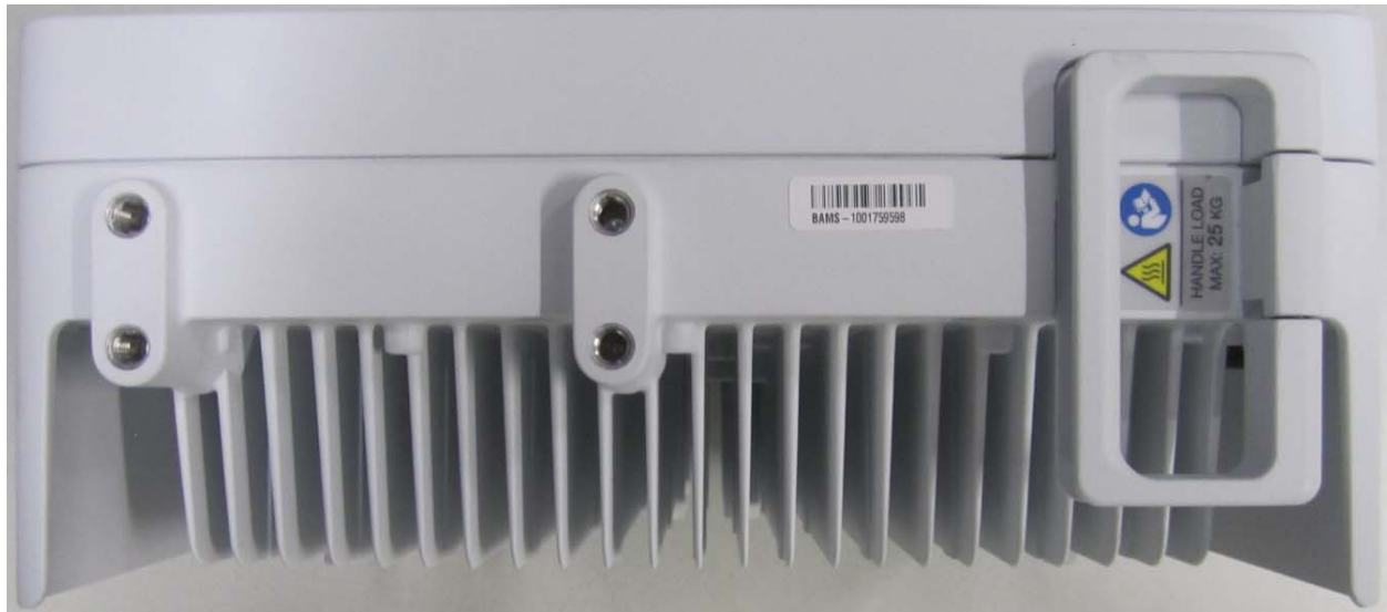
Figure 4: Radio 2212 B66A Top View