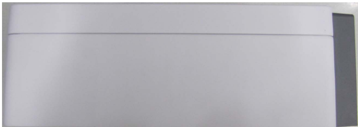
Figure 8: Radio 2212 B66A Left Side View