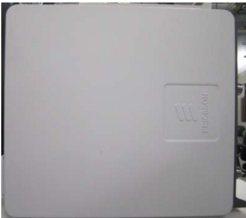
Figure 3: Radio 2212 B66A Front View