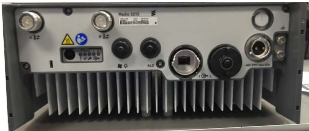
Figure 6: Radio 2212 B66A Bottom / Connector View