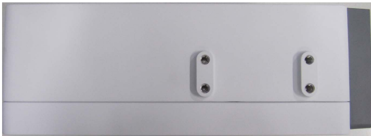
Figure 9: Radio 2212 B66A Right Side View