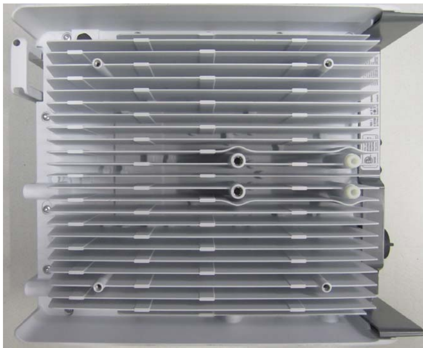
Figure 1: Radio 2212 B66A Back View