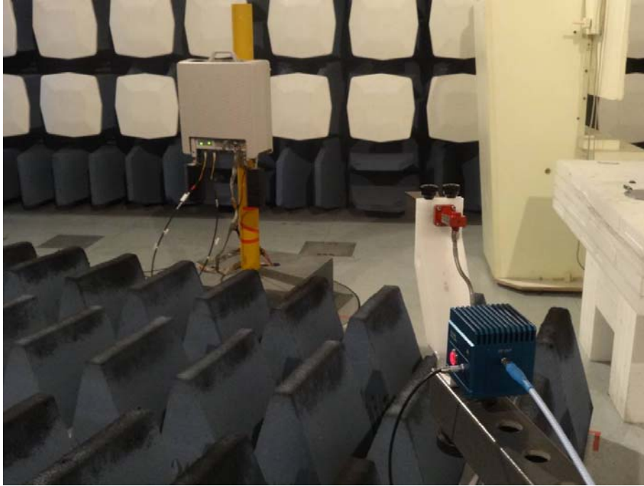
Radiated Spurious Emissions(18GHz – 20GHz)