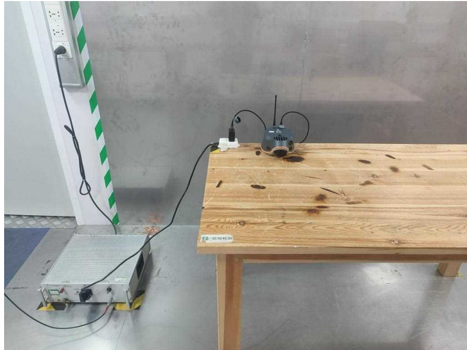
Emissions in Non-restricted Frequency Bands(30 MHz - 1 GHz)