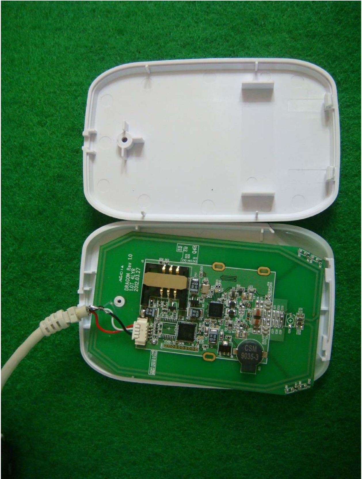
<Photograph 1: Cover removed>