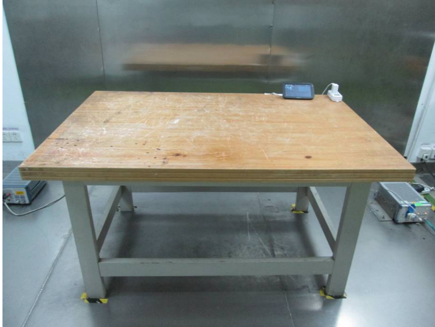
Conduction Emissions - Side View