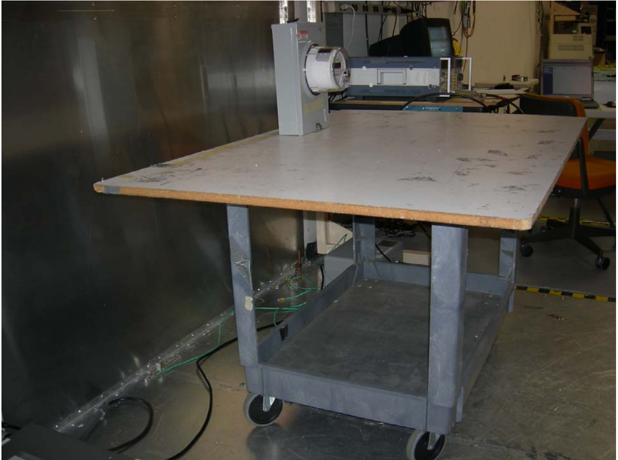
Figure 4: AC Power Line Conducted Emissions