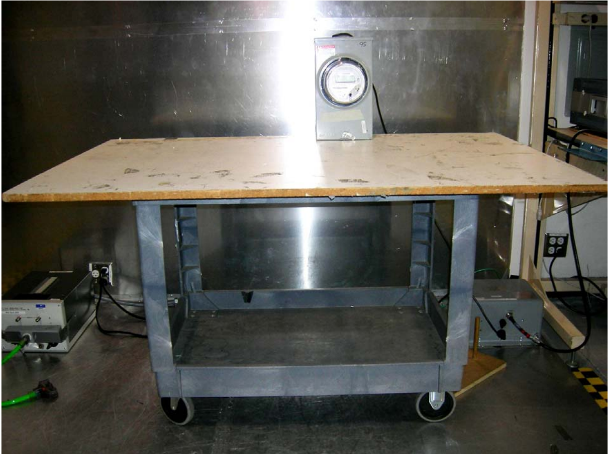
Figure 3: AC Power Line Conducted Emissions