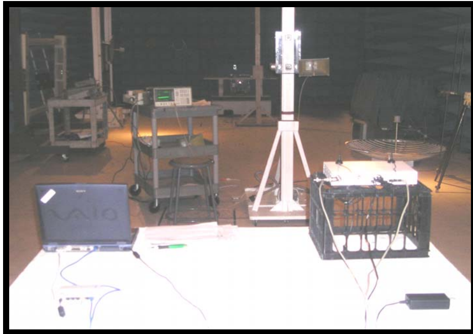
Test Setup Photo Rear View

EN 45001, NVLAP and VCCI Accredited Laboratory