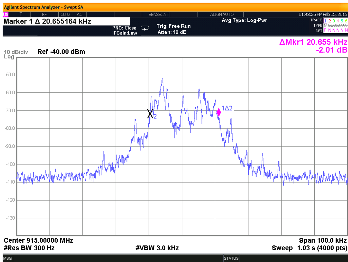
Figure 1: 20dB Occupied Bandwidth, Low Channel