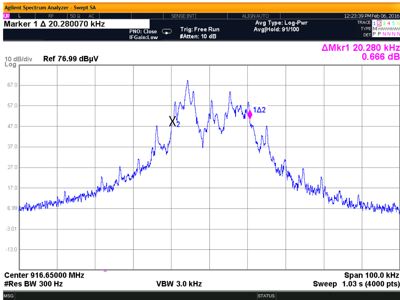
Figure 3: 20dB Occupied Bandwidth, High Channel