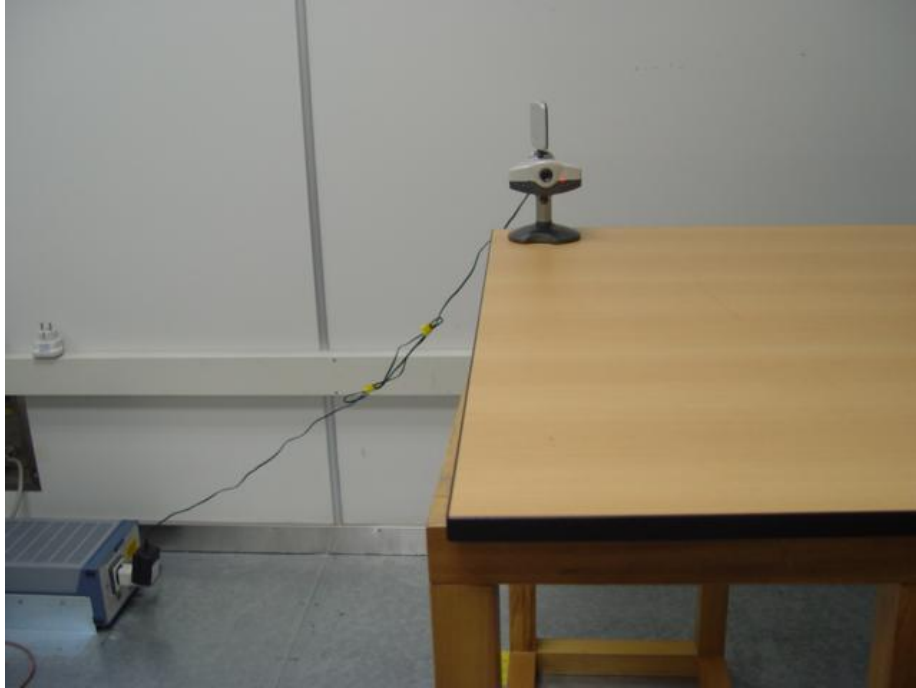
Photo 2 Test Setup for Radiated Disturbance Test