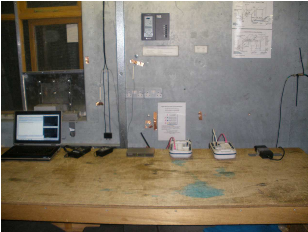
Photograph 1 Conducted Emissions - Front