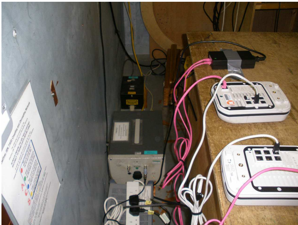
Photograph 2 Conducted Emissions - Back