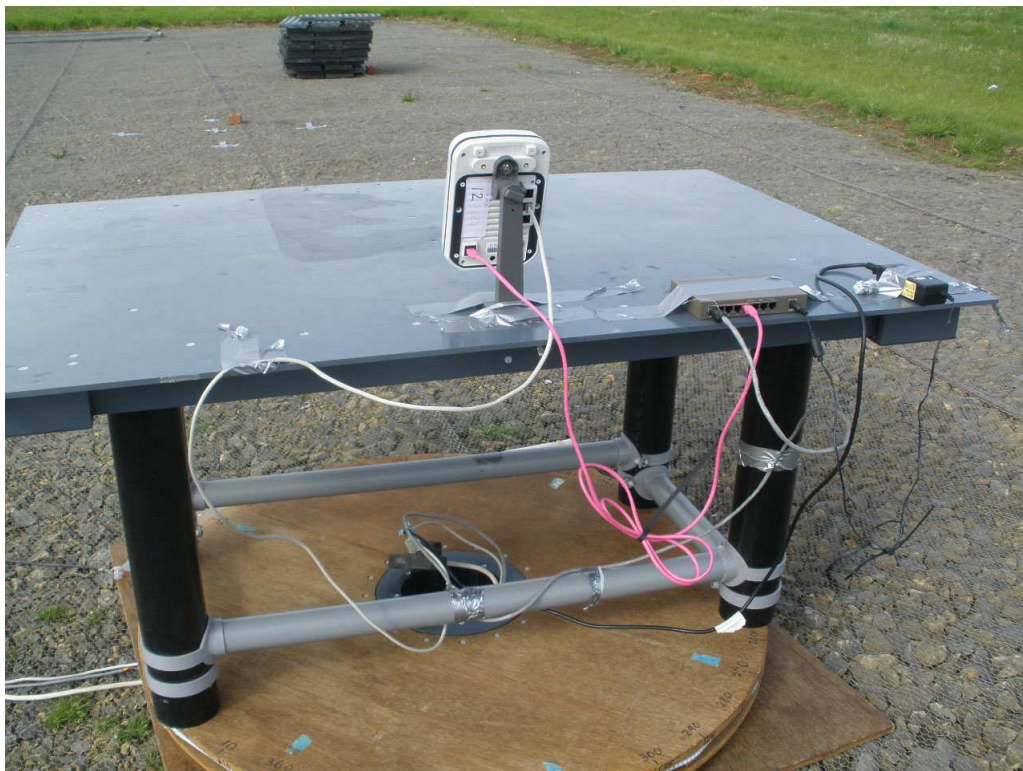
Photograph 4 Radiated Emissions - Back