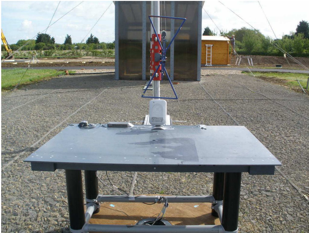
Photograph 3 Radiated Emissions - Front