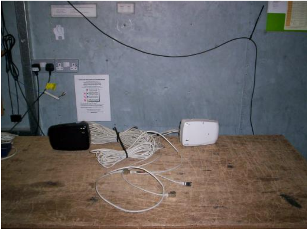
Photograph 1 Arrangement of EUT and Peripherals - Front