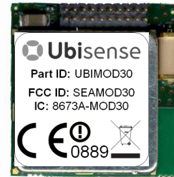
View from rear of module