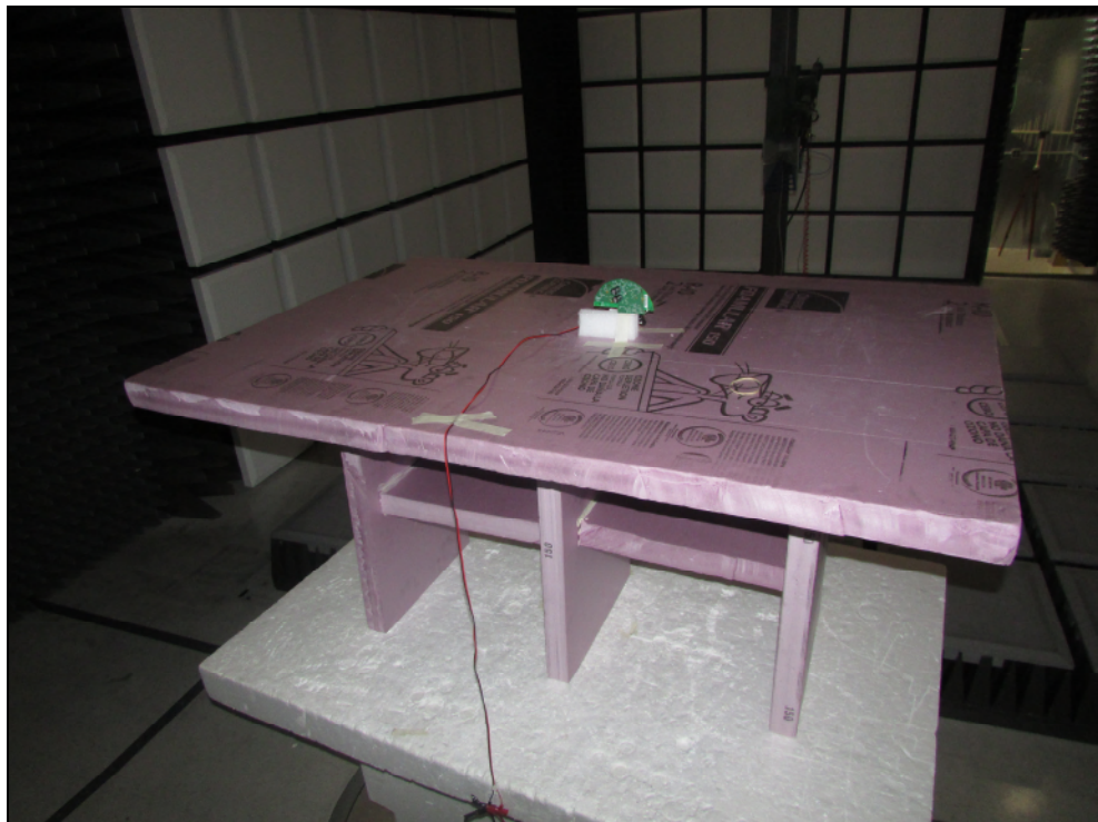
Figure 4: Radiated Emissions – Back – Above 1GHz