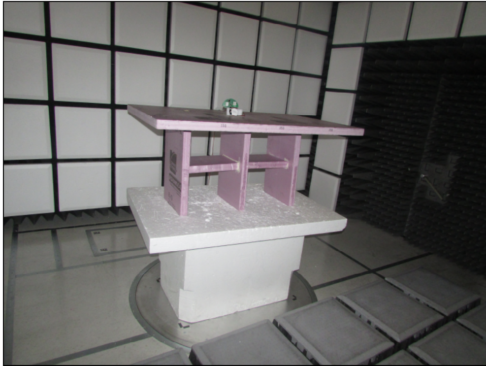
Figure 3: Radiated Emissions – Front – Above 1GHz