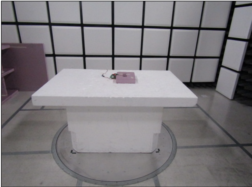
Figure 1: Radiated Emissions – Front – Below 1GHz