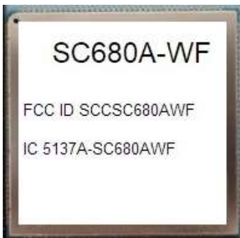
SC680A-WF with type label.