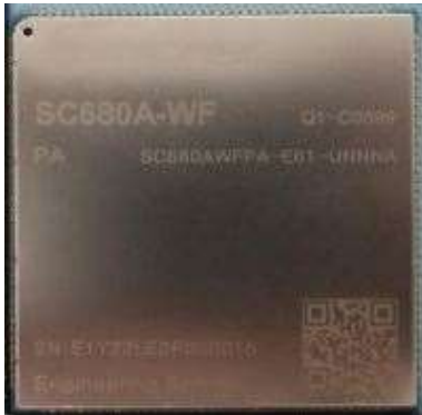
SC680A-WF module top view.