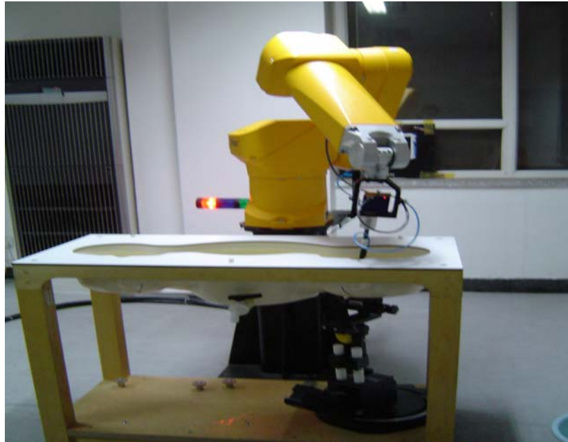
Picture 1 test setup