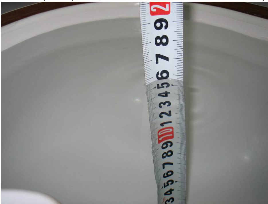
Picture 10 Liquid Depth at Ear Reference Point for 1900MHz Head Liquid