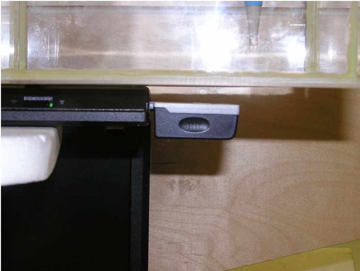
Photo 2. Lap with antenna closed