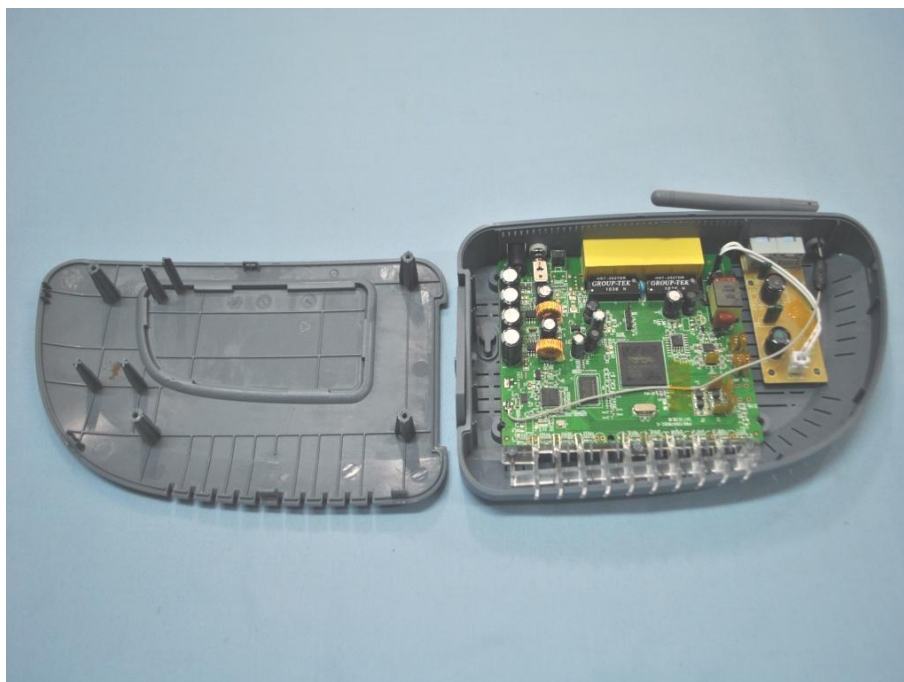
Main & RF board component side