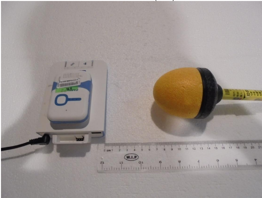
E-Field Measurement (10cm)