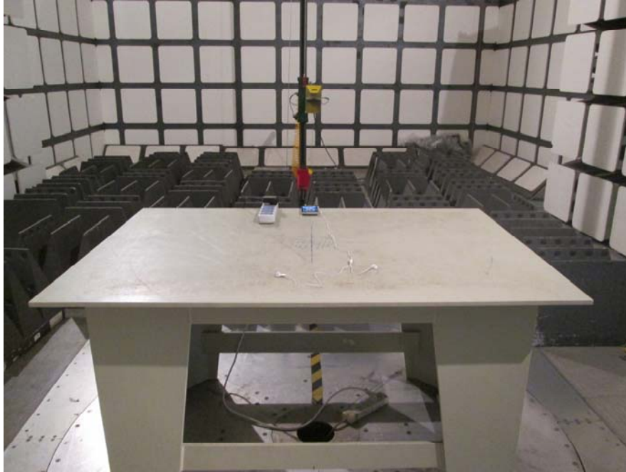
Radiated Emissions – Rear View (Above 1GHz)