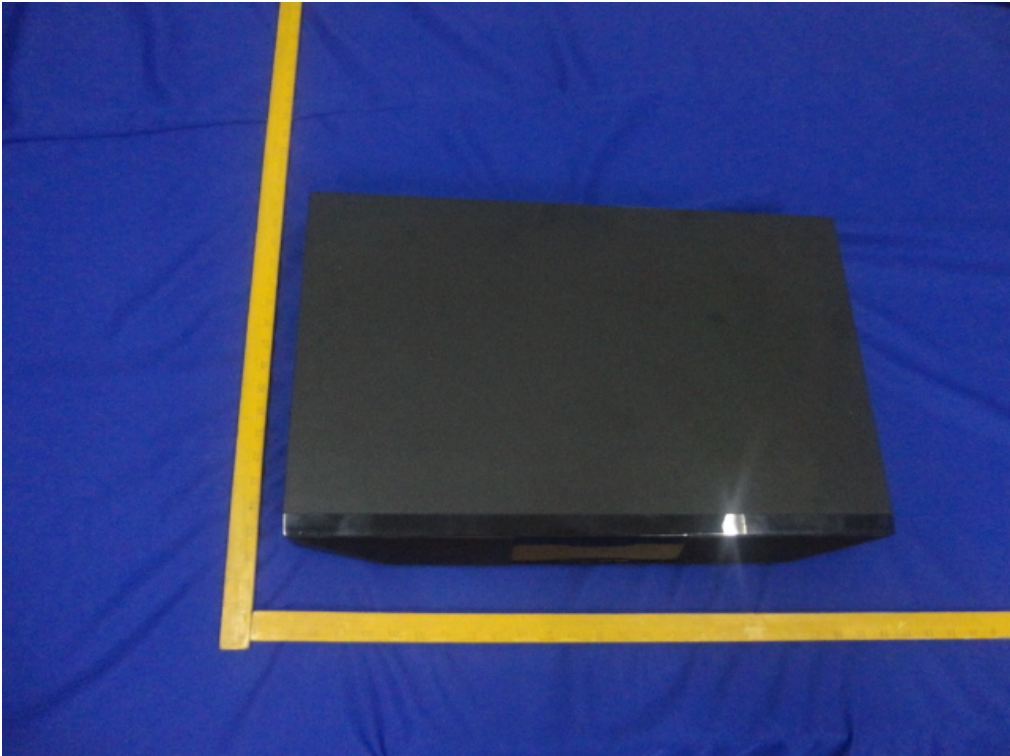
External Photos M/N: SBT2015