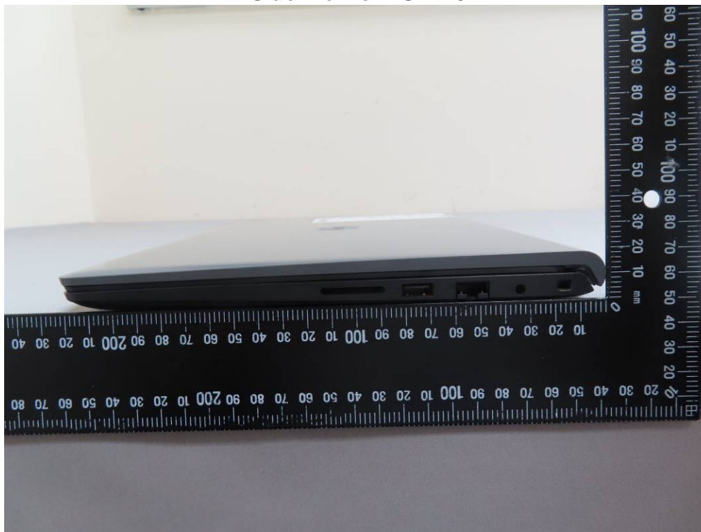
Side View of EUT – 5

Unless otherwise stated the results shown in this test report refer only to the sample(s) tested and such sample(s) are retained for 90 days only.