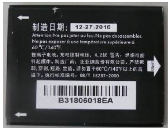
b: Battery 1