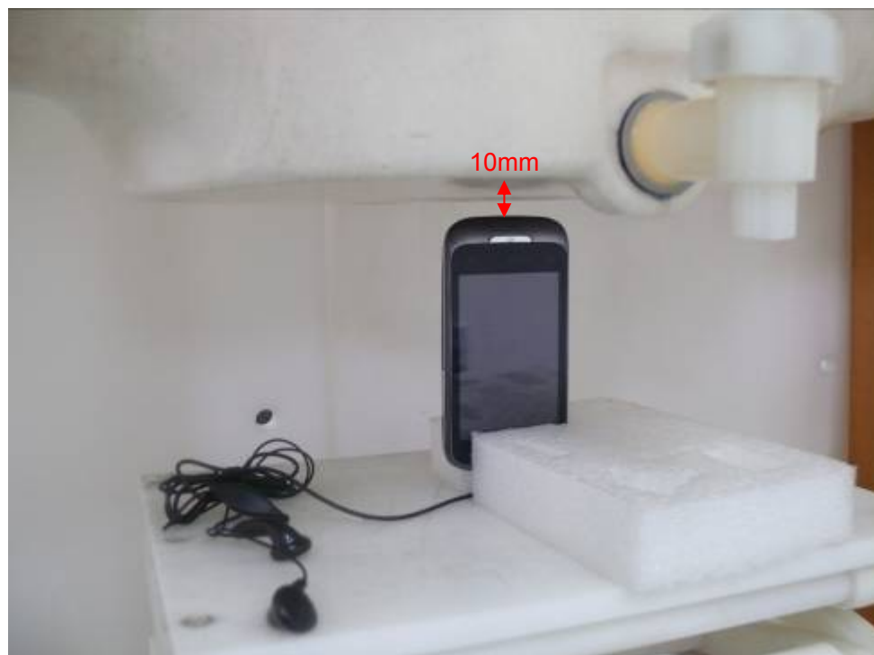
Picture 22: Bottom Edge with Stereo Headset 1, the distance from handset to the bottom of the Phantom is 10mm (Battery 1)