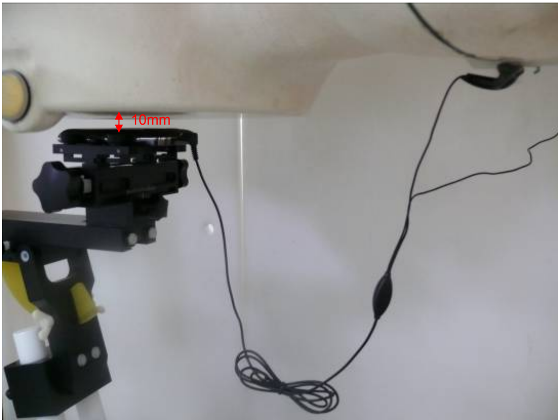
Picture 23: Back Side with Stereo Headset 2, the distance from handset to the bottom of the Phantom is 10mm (Battery 1)