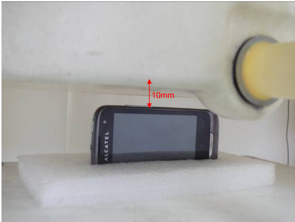
Picture 17: Right Edge, the distance from handset to the bottom of the Phantom is 10mm (Battery 1)