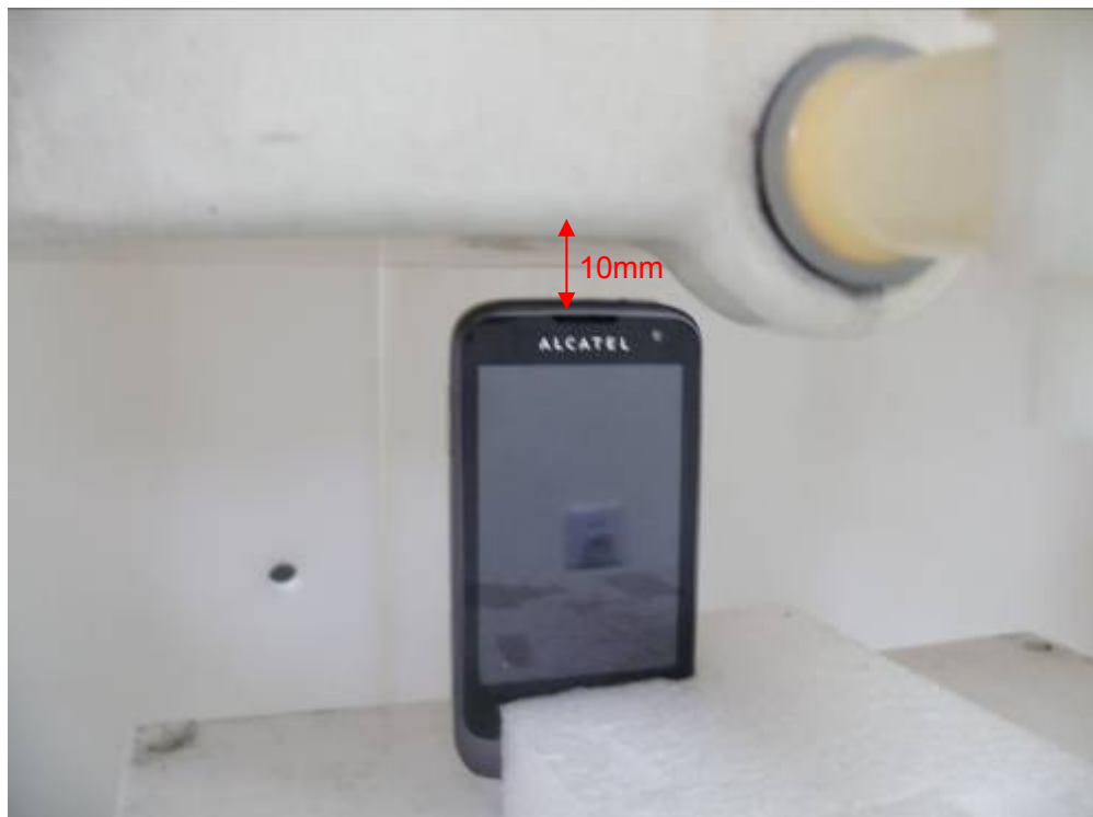
Picture 18: Top Edge, the distance from handset to the bottom of the Phantom is 10mm (Battery 1)