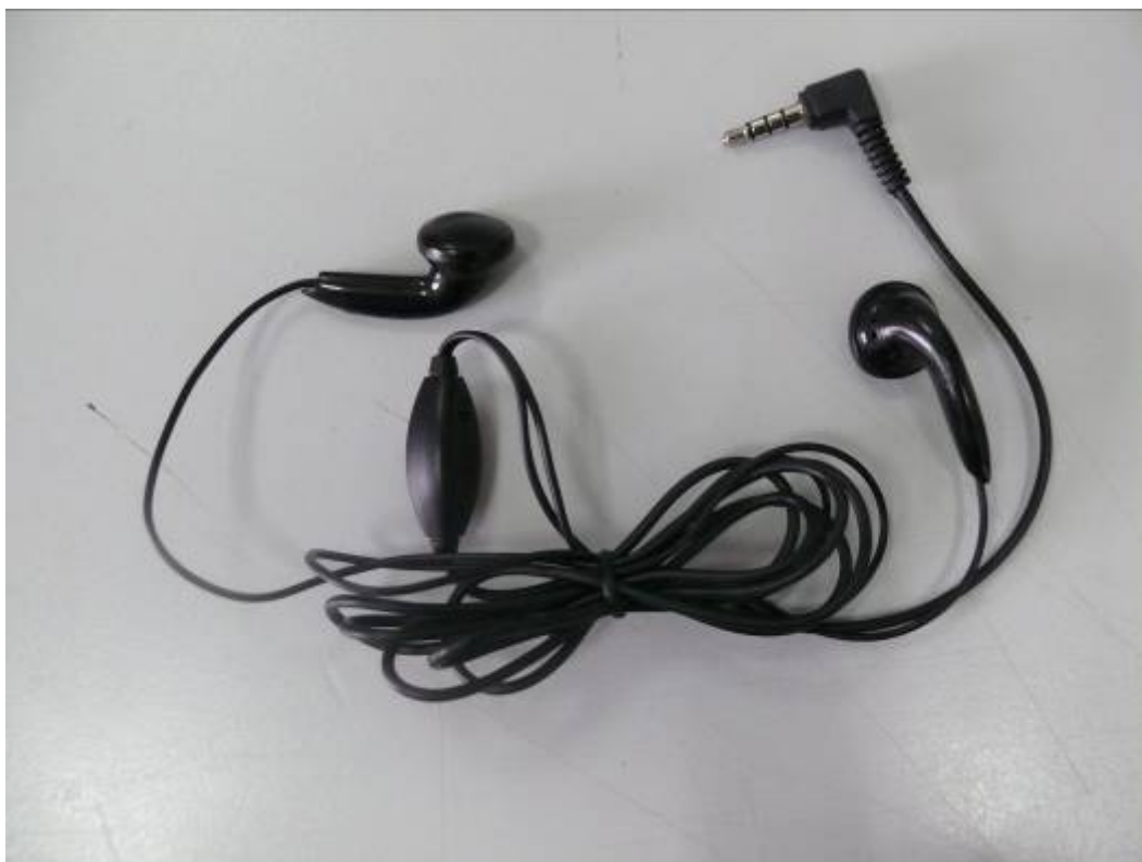
f: Stereo Headset 2