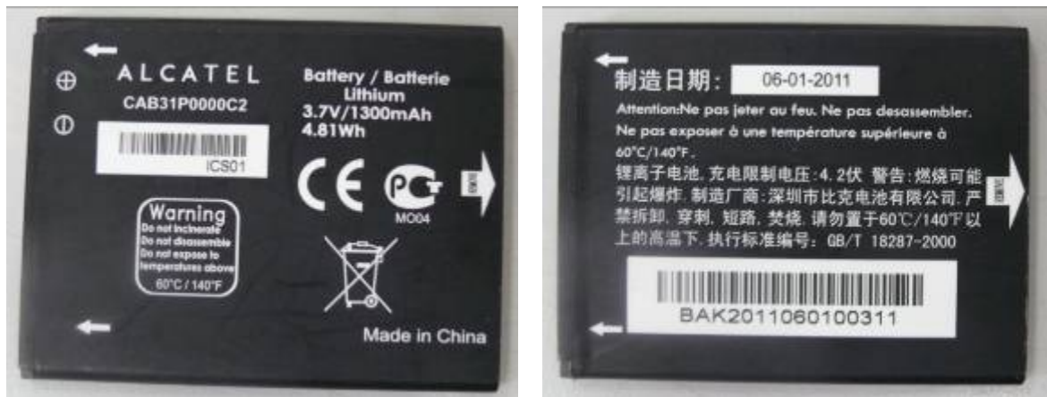
c: Battery 2