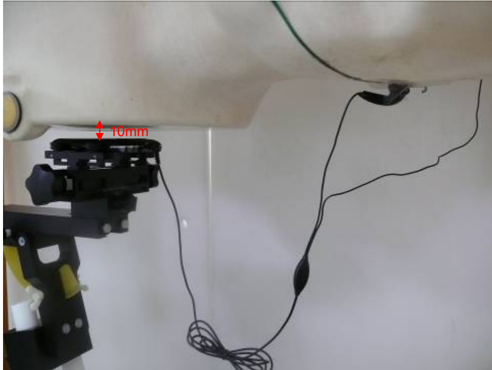
Picture 21: Back Side with Stereo Headset 1, the distance from handset to the bottom of the Phantom is 10mm (Battery 1)