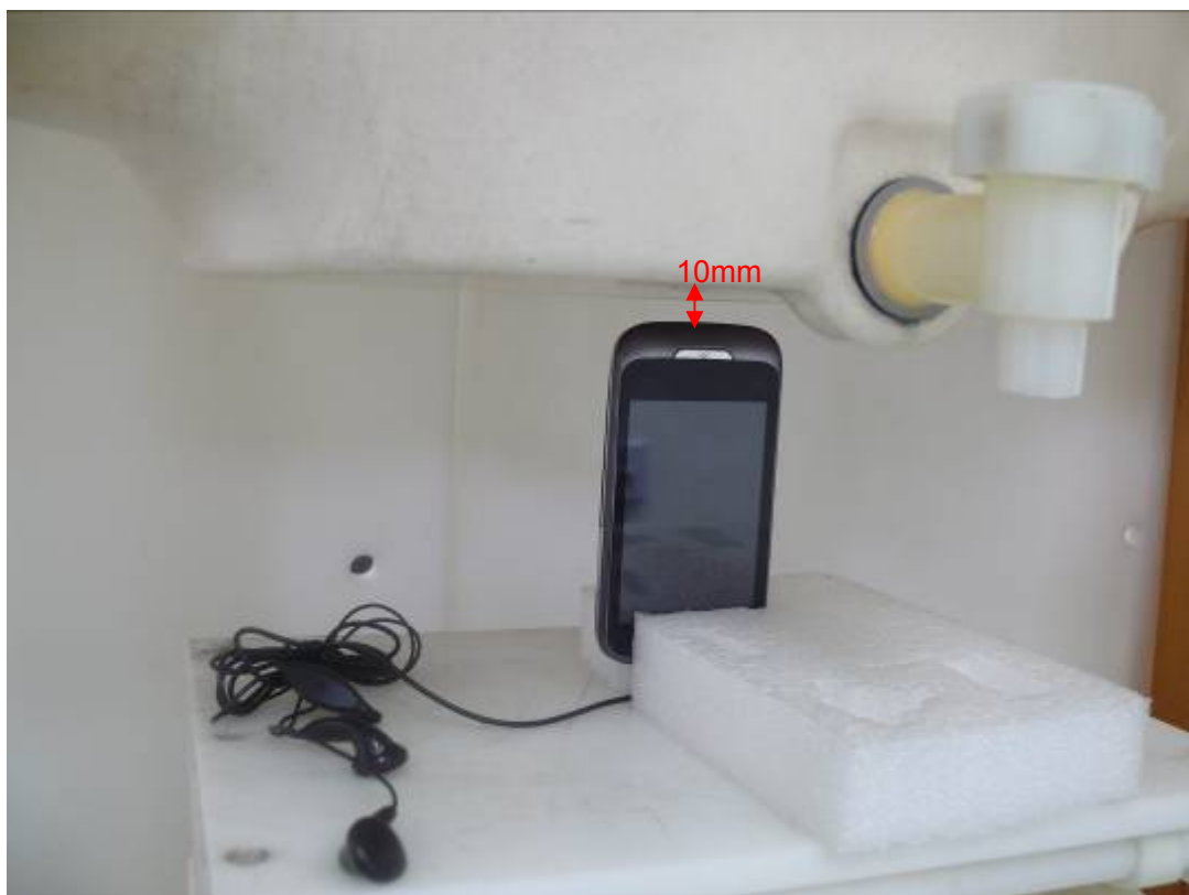
Picture 24: Bottom Edge with Stereo Headset 2, the distance from handset to the bottom of the Phantom is 10mm (Battery 1)