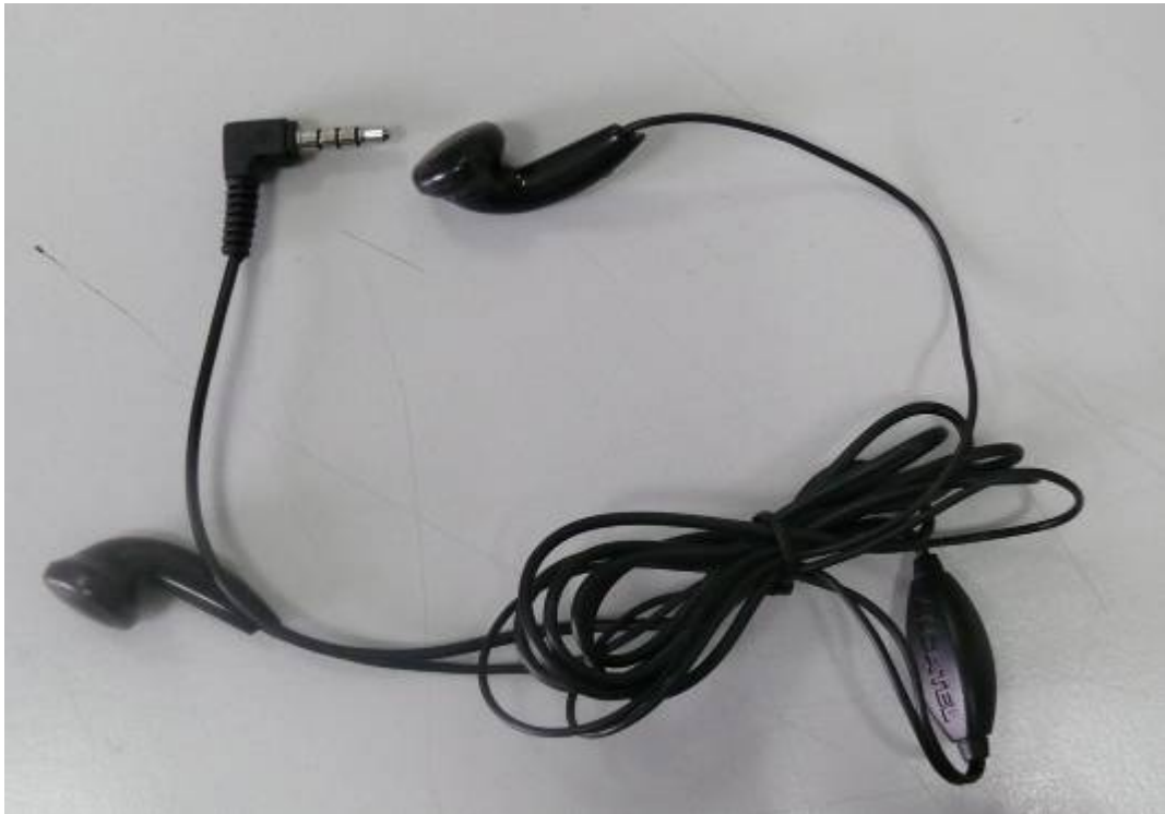
e: Stereo Headset 1