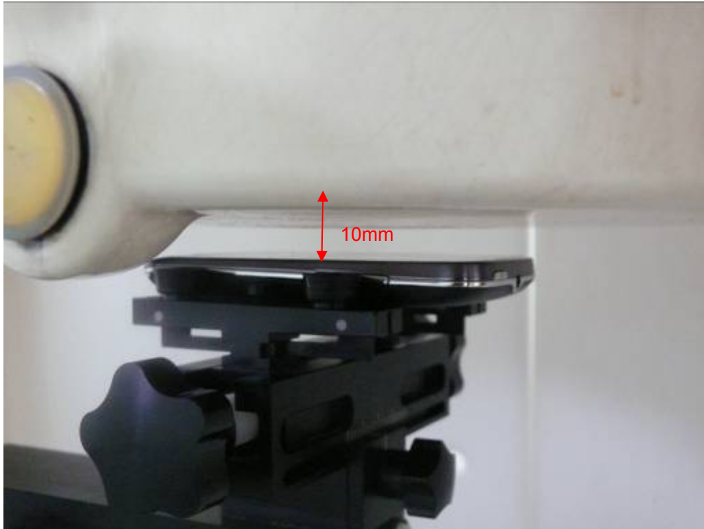
Picture 15: Front Side, the distance from handset to the bottom of the Phantom is 10mm (Battery 1)