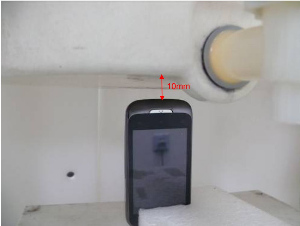
Picture 19: Bottom Edge, the distance from handset to the bottom of the Phantom is 10mm (Battery 1)