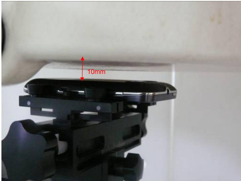
Picture 14: Back Side, the distance from handset to the bottom of the Phantom is 10mm (Battery 1)