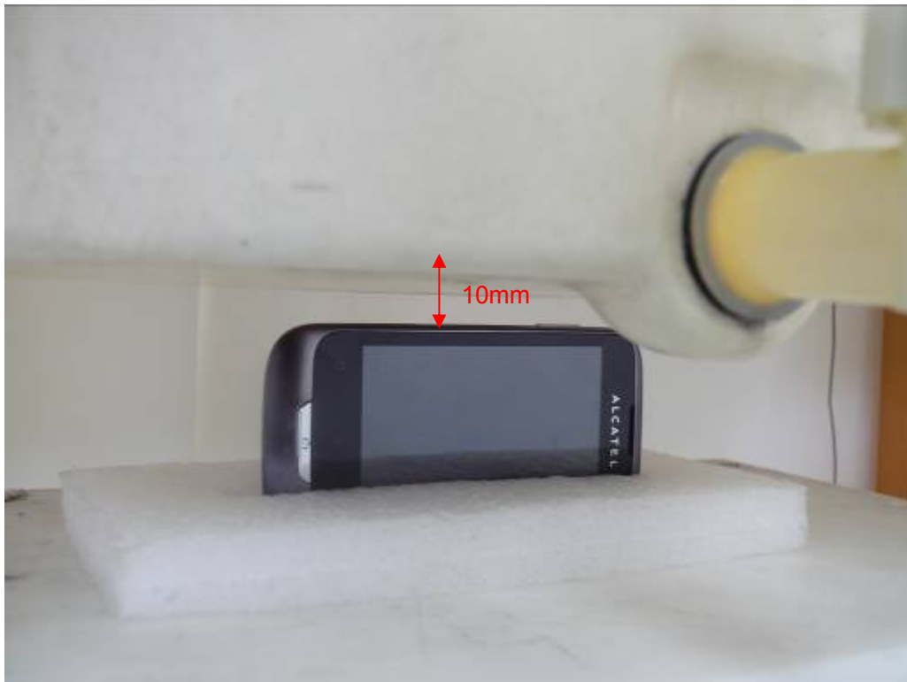
Picture 16: Left Edge, the distance from handset to the bottom of the Phantom is 10mm (Battery 1)