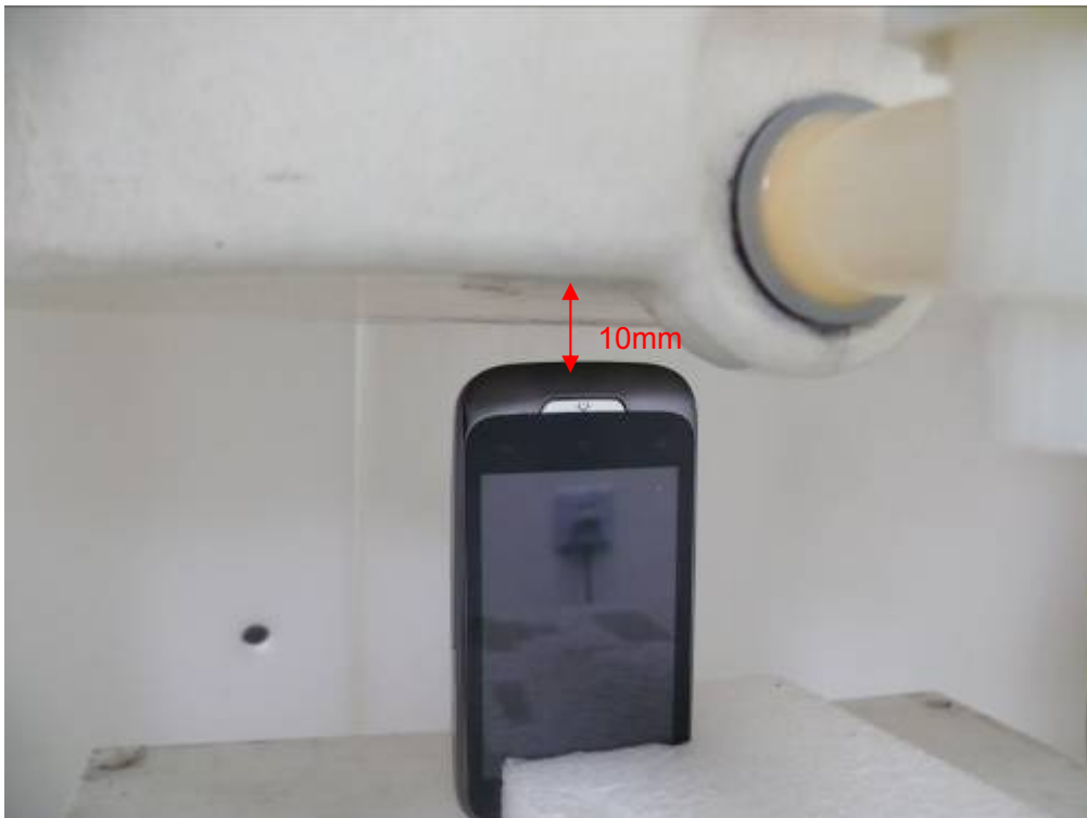
Picture 20: Bottom Edge, the distance from handset to the bottom of the Phantom is 10mm (Battery 2)