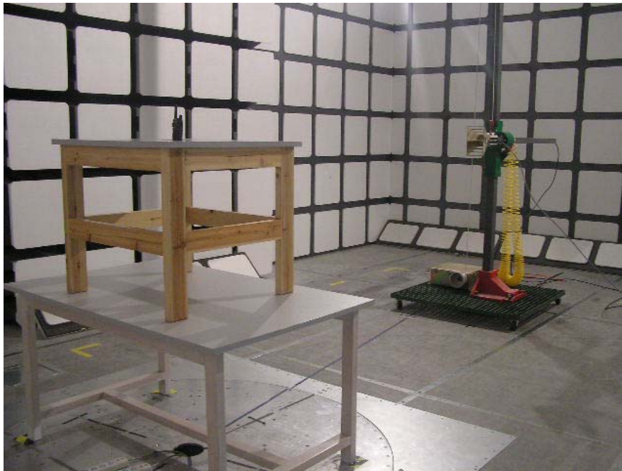
Radiated Emission - Rear View (Above 1000 MHz)