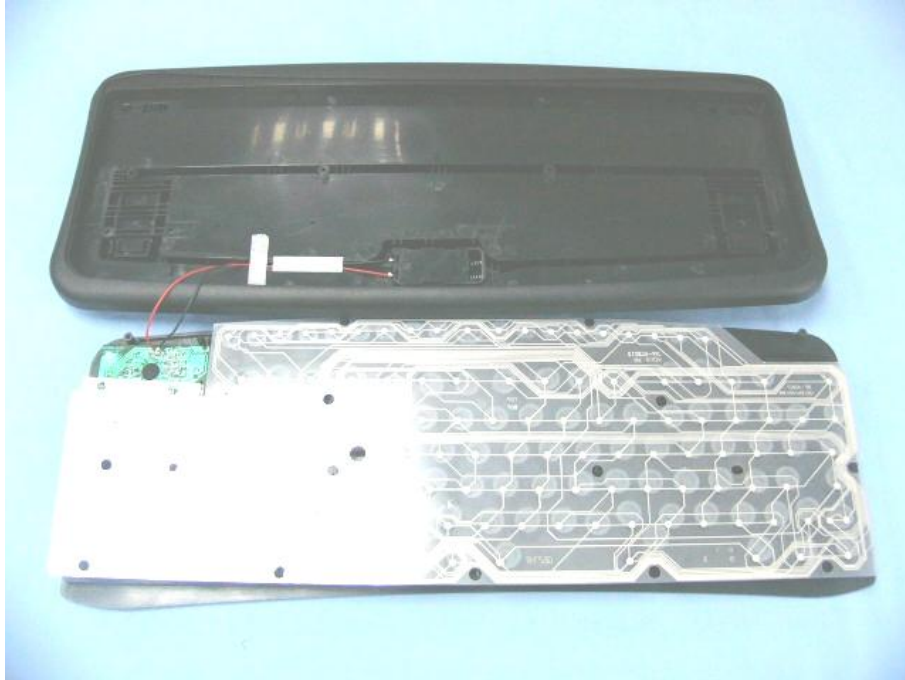
Main board component side