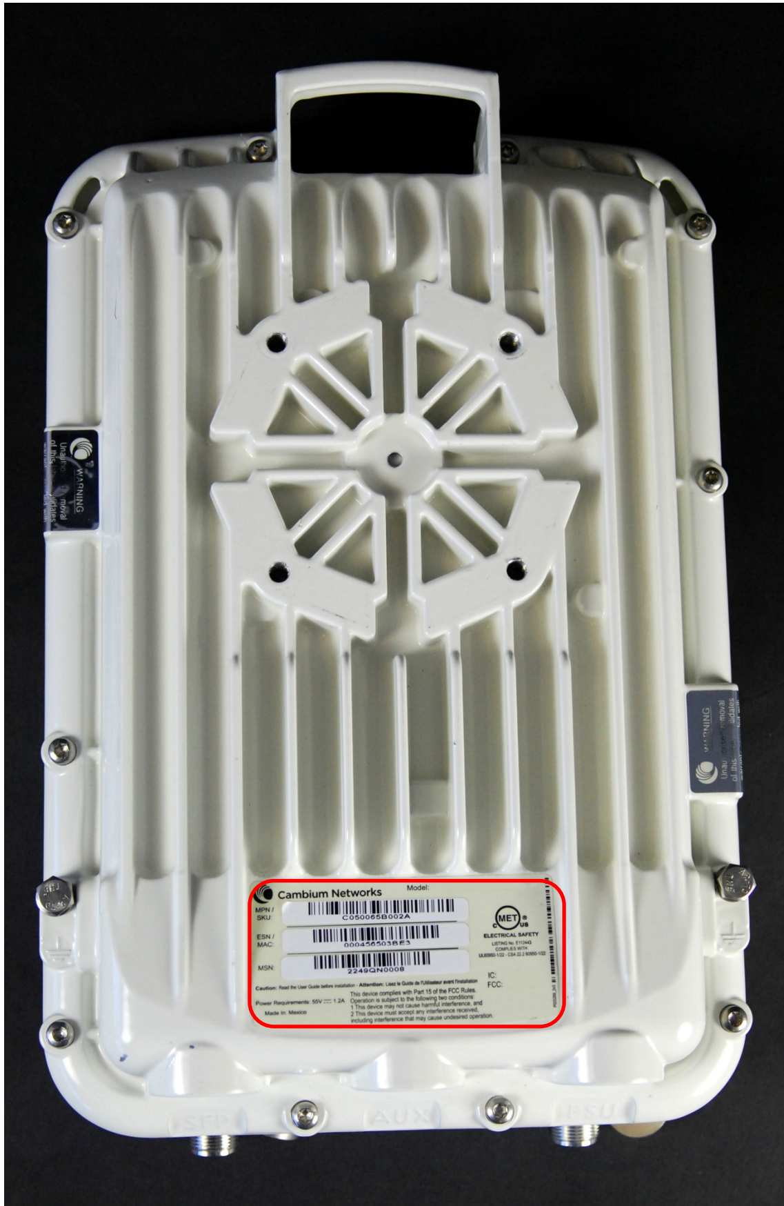
Rear View C050067B014A - PTP 670 (4.9 to 5.9 GHz) ATEX/HAZLOC Connectorized ODU (FCC)

PTP 670 FCC ID: QWP-50670EX, ATEX/HAZLOC variant of the PTP 670. Label Position highlighted in RED