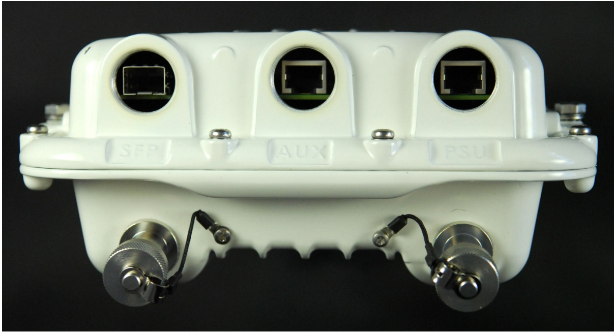
Bottom View C050067B014A - PTP 670 (4.9 to 5.9 GHz) ATEX/HAZLOC Connectorized ODU (FCC)

PTP 670 FCC ID: QWP-50670EX, ATEX/HAZLOC variant of the PTP 670. Label Position highlighted in RED