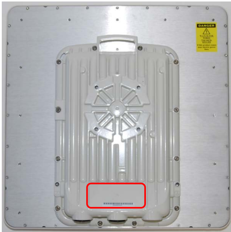
Rear View C050067B013A - PTP 670 (4.9 to 5.9 GHz) ATEX/HAZLOC Integrated 23 dBi ODU (FCC)