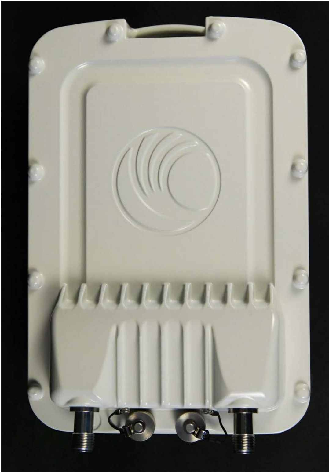
Front View C050067B014A - PTP 670 (4.9 to 5.9 GHz) ATEX/HAZLOC Connectorized ODU (FCC)