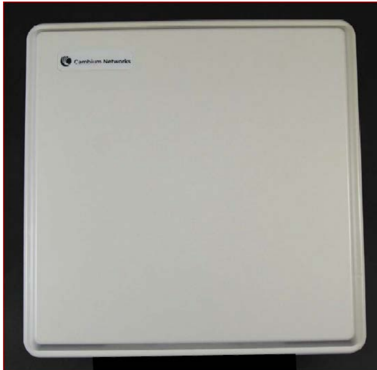
Front View C050067B013A - PTP 670 (4.9 to 5.9 GHz) ATEX/HAZLOC Integrated 23 dBi ODU (FCC)

PTP 670 FCC ID: QWP-50670EX, ATEX/HAZLOC variant of the PTP 670. Label Position highlighted in RED