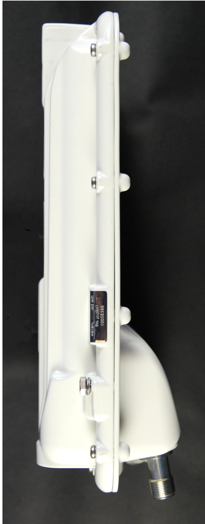
Side View C050067B014A - PTP 670 (4.9 to 5.9 GHz) ATEX/HAZLOC Connectorized ODU (FCC)

PTP 670 FCC ID: QWP-50670EX, ATEX/HAZLOC variant of the PTP 670. Label Position highlighted in RED