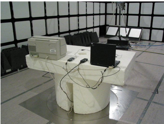
Picture 2 Radiated emission 15B