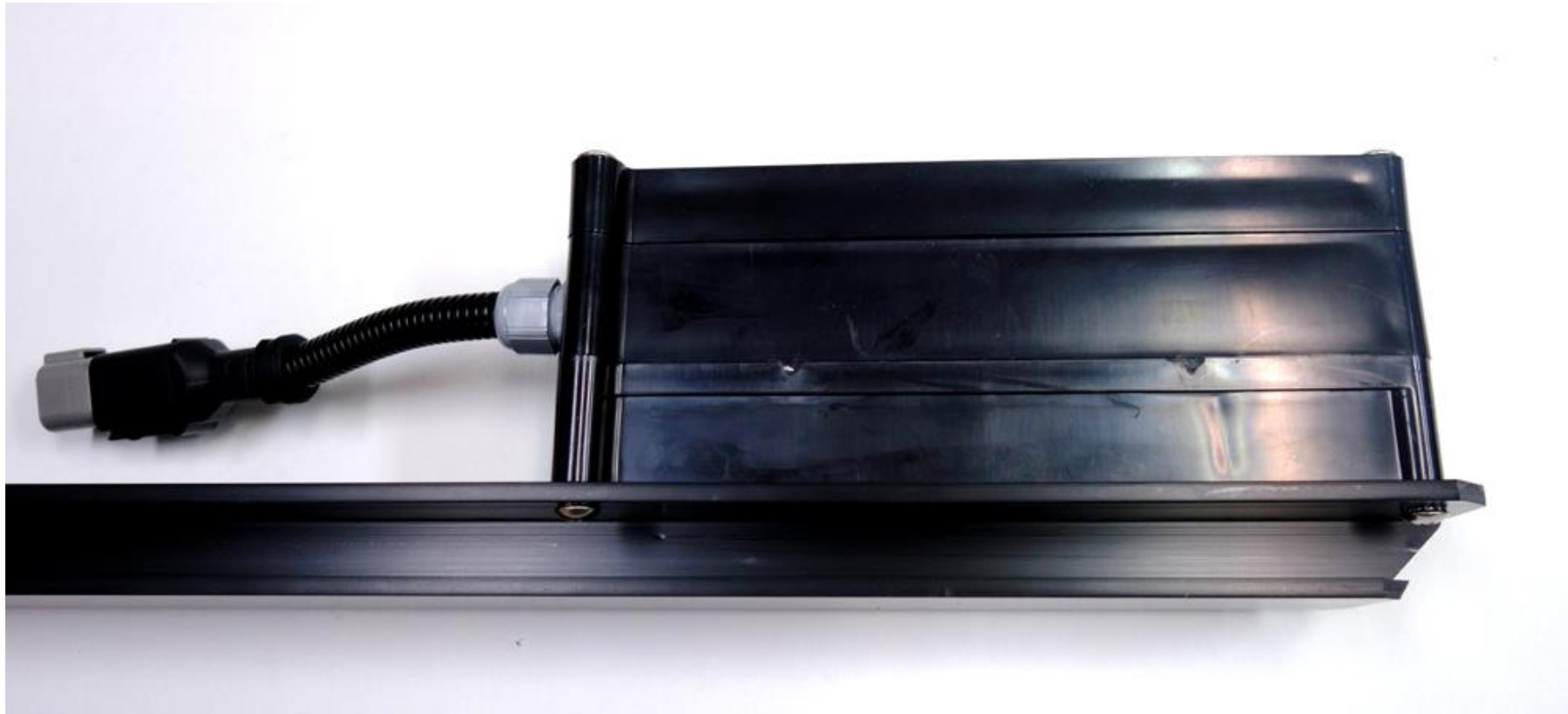
Magnetic Field Generator-External Photo Side View with Mounting Arm