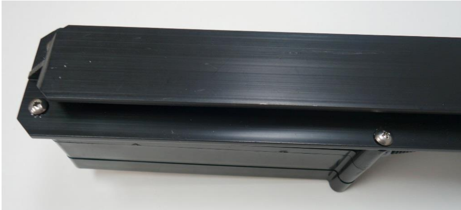
Magnetic Field Generator-External Photo Ferrite Side with Mounting Arm