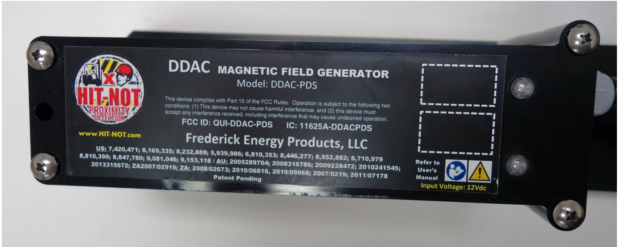
Magnetic Field Generator-External Photo Label Side with Mounting Arm