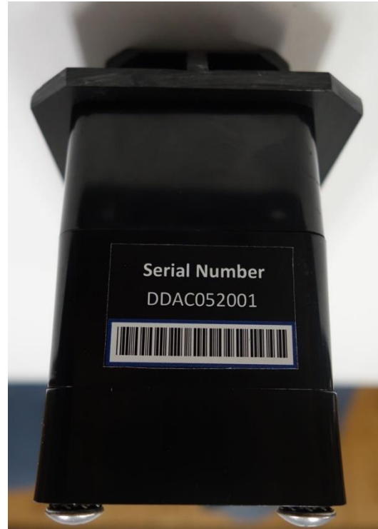
Magnetic Field Generator-External Photo End View with Mounting Arm