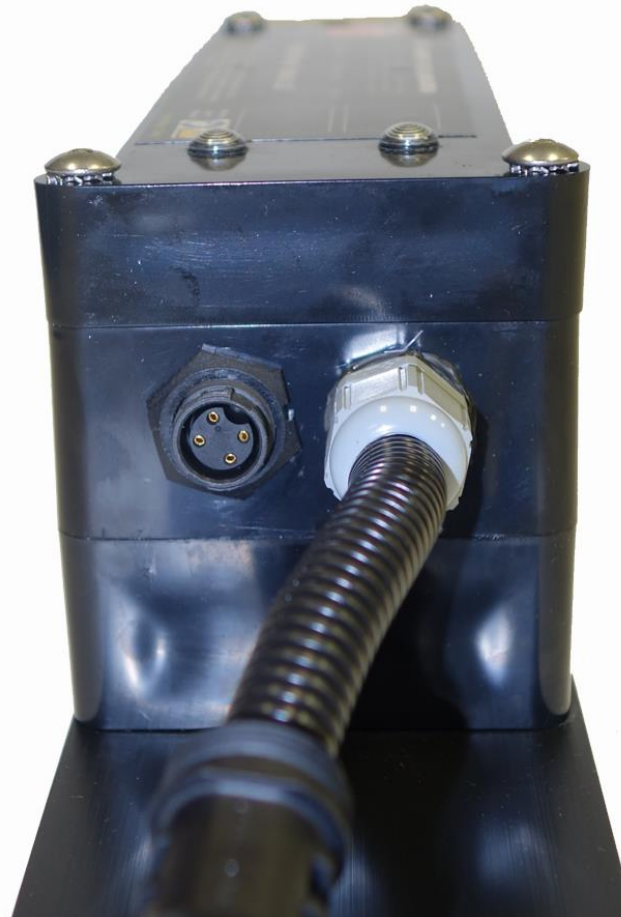
Magnetic Field Generator-External Photo Interface End View with Mounting Arm