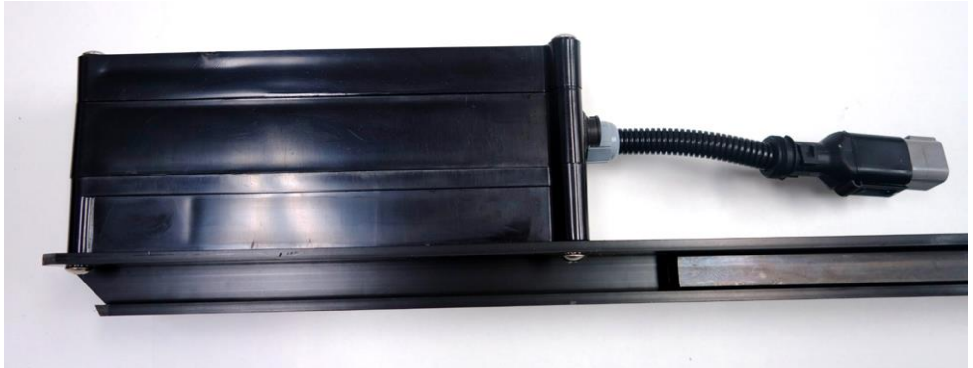
Magnetic Field Generator-External Photo Side View with Mounting Arm