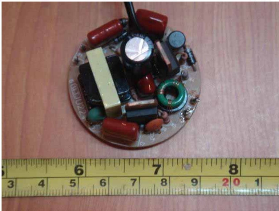
PCB - Back View For CFLE18SX/L/827/840/865