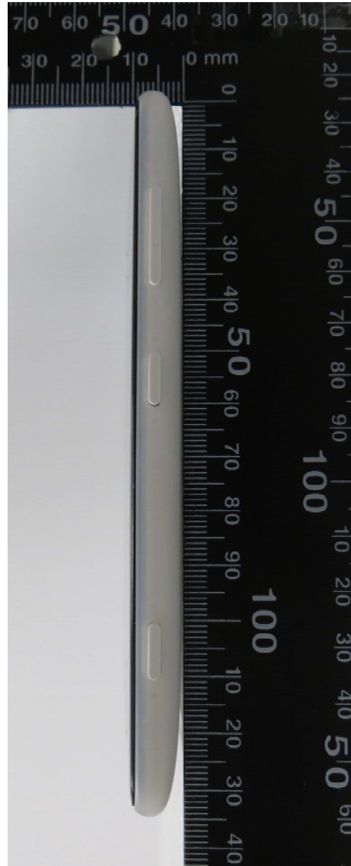
Exhibit 3: External Photographs