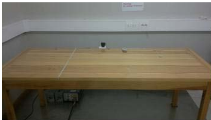
Picture 4. FCC Part 15C AC powerline conducted emissions