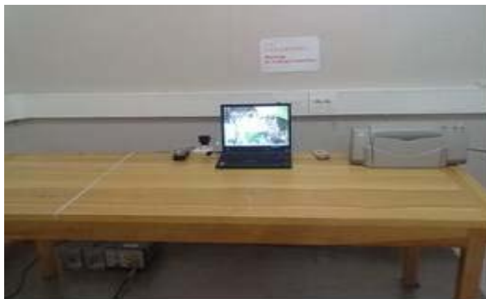
Picture 6. FCC Part 15B AC powerline conducted emissions, computer peripherals, measure from mobile phone charger