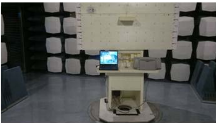
Picture 3. FCC Part 15B Radiated emissions, computer peripherals