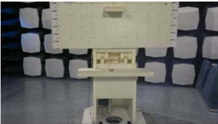
Picture 2. FCC Part 15B Radiated emissions