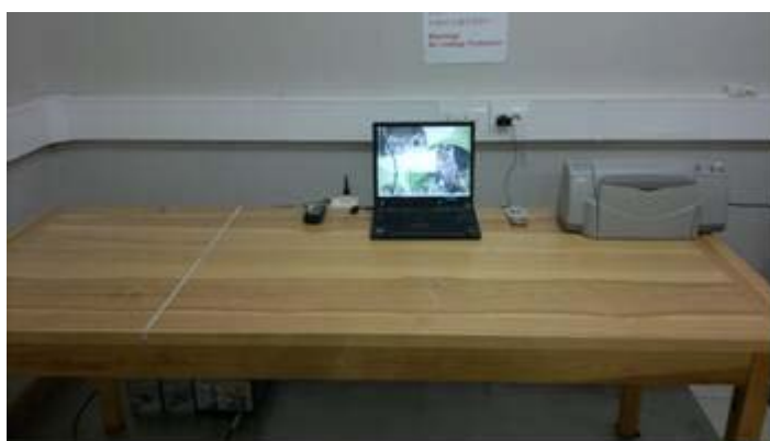
Picture 5. FCC Part 15B AC powerline conducted emissions, computer peripherals, measure from PC charger