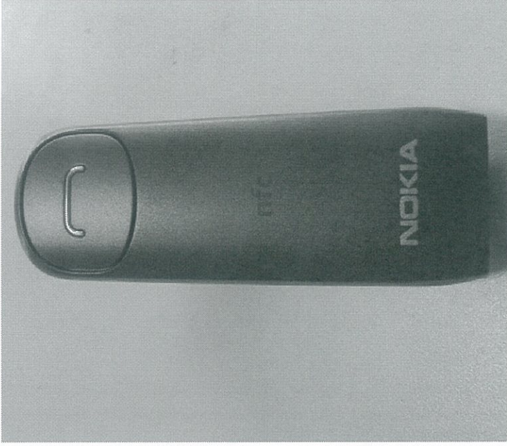
change to this A cover