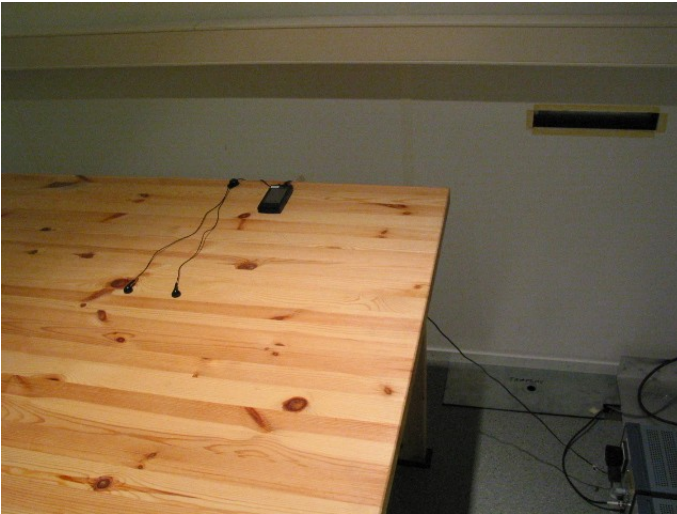
Picture 3. FCC Part 15C AC powerline conducted emissions