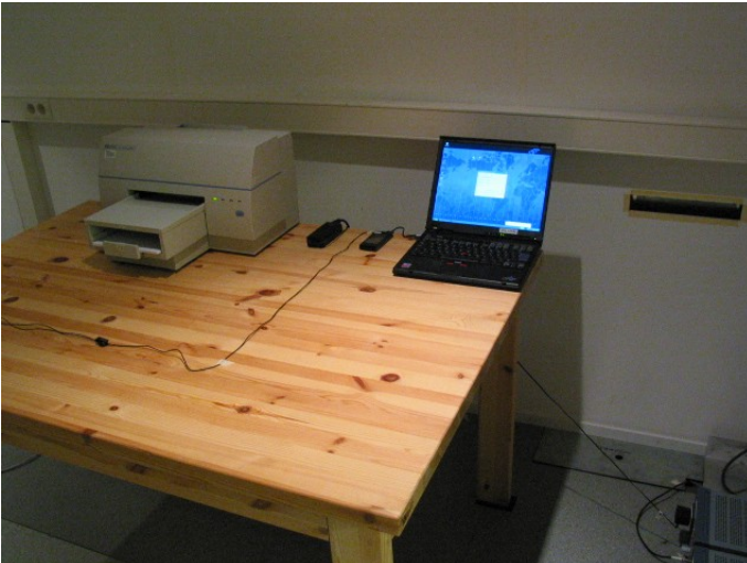
Picture 4. FCC Part 15B AC powerline conducted emissions