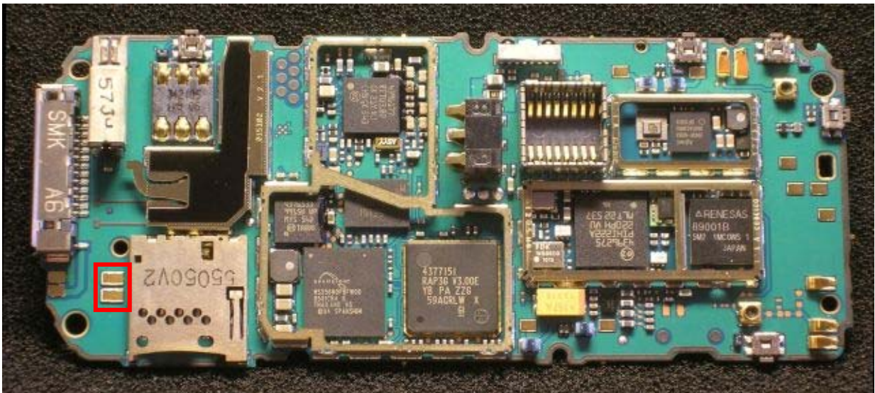
BATTERY Side (TOP side in parts list). Pads marked in red are BT antenna connection points. BT antenna is enclosed in phone's mechanics.