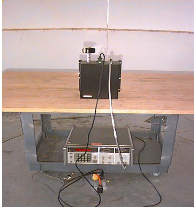
Range Set up: Photo

EQUIPMENT: BDA-PCS/A-1/1W-80-B And BDA-PCS/C-1/1W-80-B, In-Building Repeaters