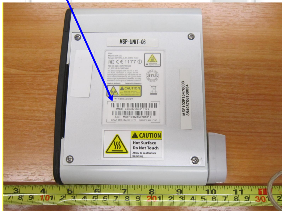
Physical Location of FCC Label on EUT