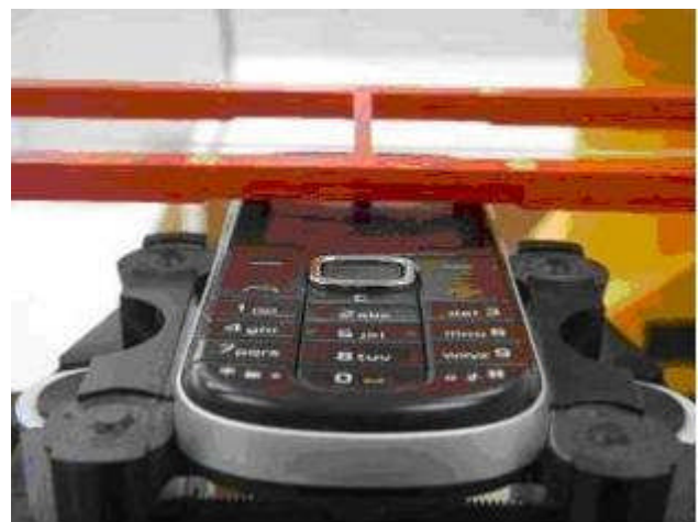
Fig.2 Receiver of mobile contact center of Arch.