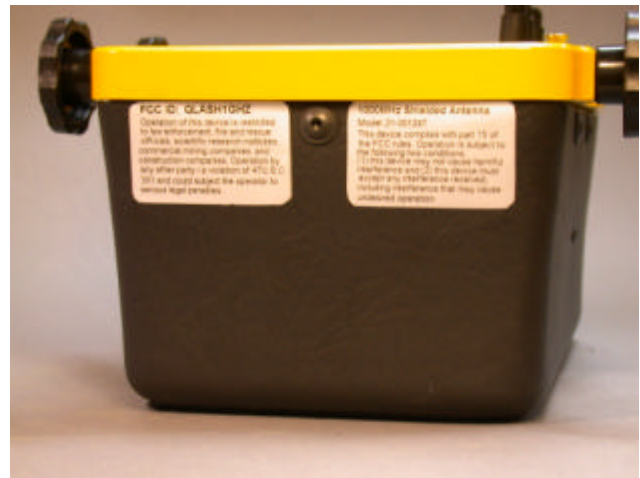
Picture 2. Labels on UWB unit