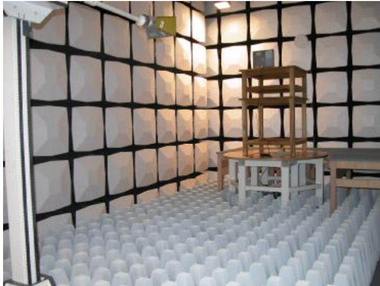
Radiated Spurious Emission (over1 GHz)