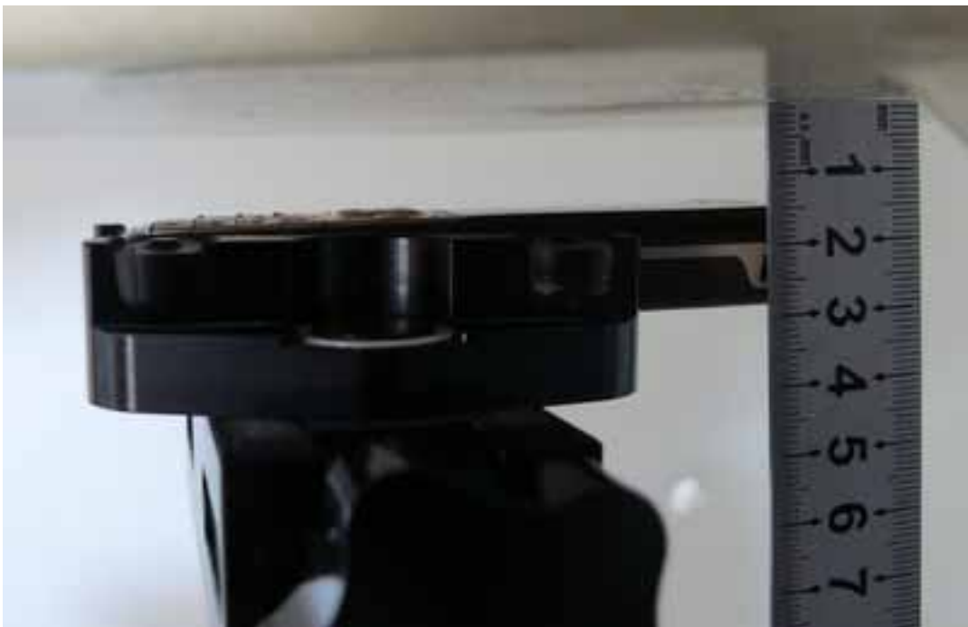
Picture 10: Body, The EUT display towards phantom, the distance from handset to the bottom of the Phantom is 15mm)