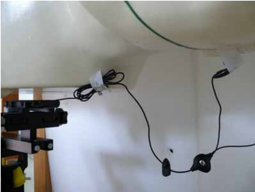
Picture 11: Body with earphone, The EUT display towards ground, the distance from handset to the bottom of the Phantom is 15mm)