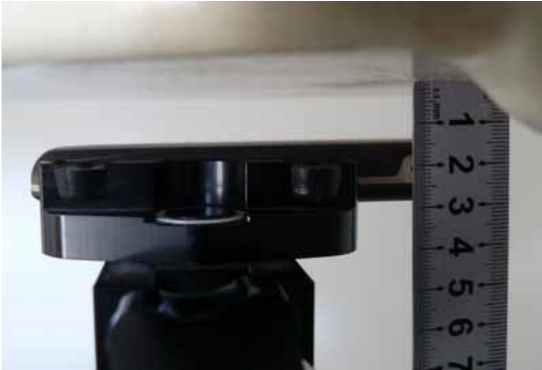
Picture 9: Body, The EUT display towards ground, the distance from handset to the bottom of the Phantom is 15mm)