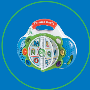
Phonics Radio 18+ months