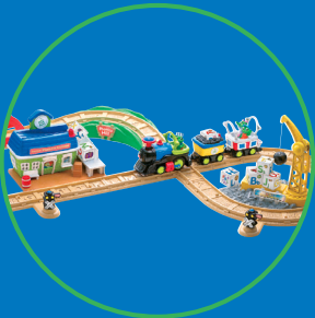
Leap's Phonics™ Railroad 2+ years