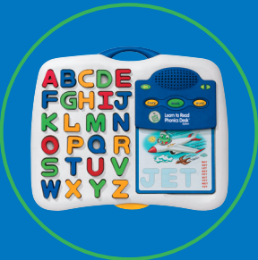
Learn to Read Phonics Desk® System 3+ years