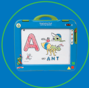
Imagination Desk® Learning System 3+ years