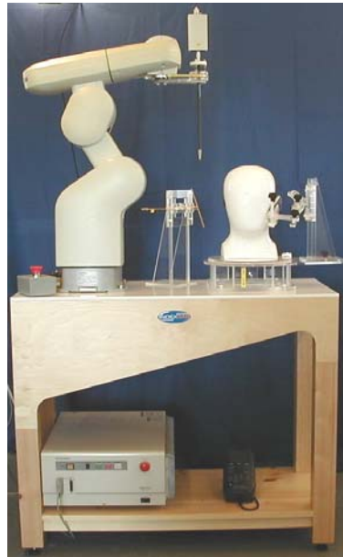
Figure 6: Principal components of the SAR measurement test bench

The major components of the test bench are shown in the picture above. A test set and dipole antenna control the handset via an air link and a low-mass phone holder can position the phone at either ear. Graduated scales are provided to set the phone in the 15 degree position. The upright phantom head holds approx. 7 litres of simulant liquid. The phantom is filled and emptied through a 45mm diameter penetration hole in the top of the head.