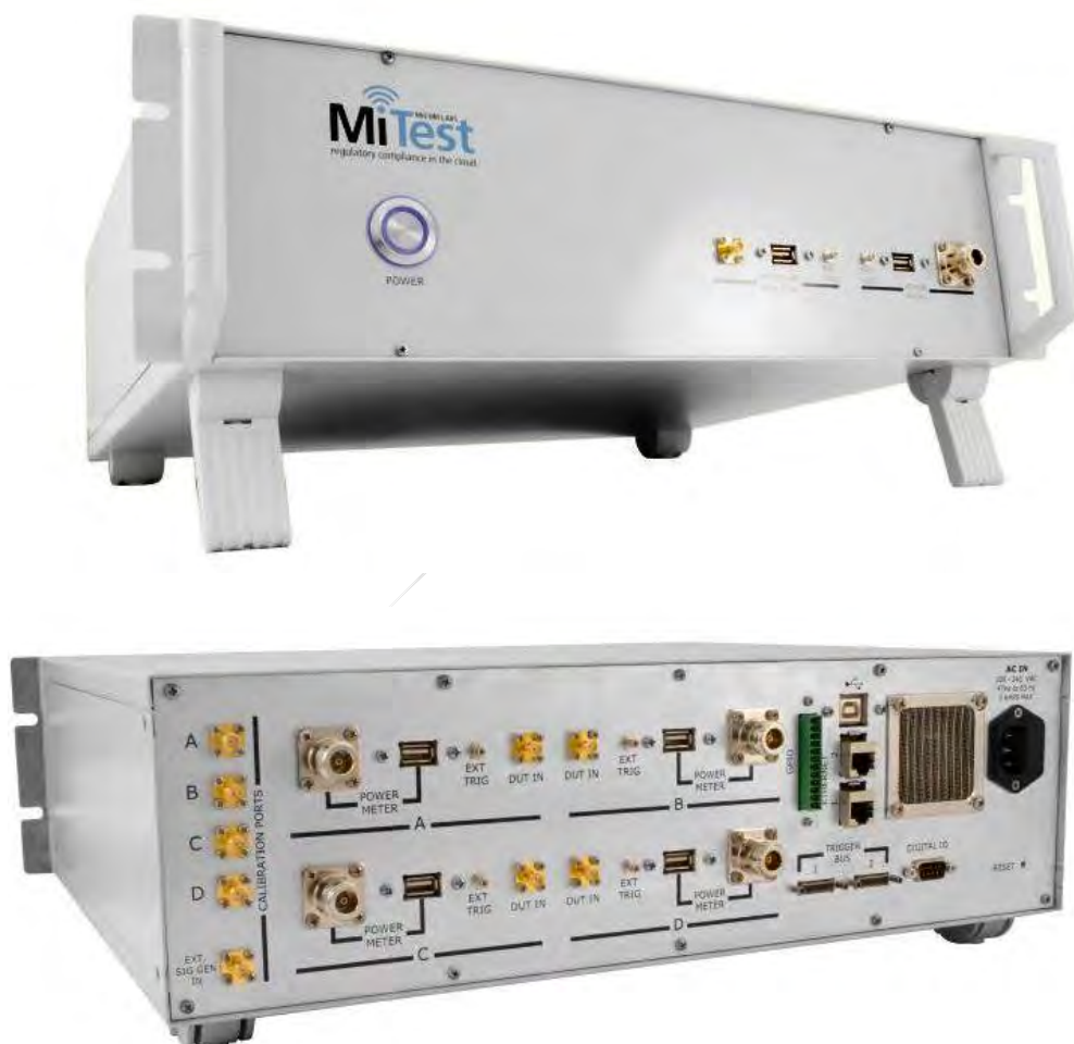
The MiCOM Labs " MiTest " Automated Test System" (Patent Pending)

Test and report automation was performed by MiTest . MiTest is an automated test system developed by MiCOM Labs. MiTest is the first cloud based modular test system enabling end-to-end automation of regulatory compliance testing for conducted RF testing.