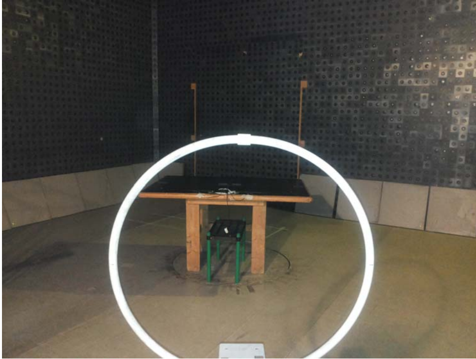
Photograph No.1 Spurious emissions field strength measurement setup in the anechoic chamber below 30 MHz