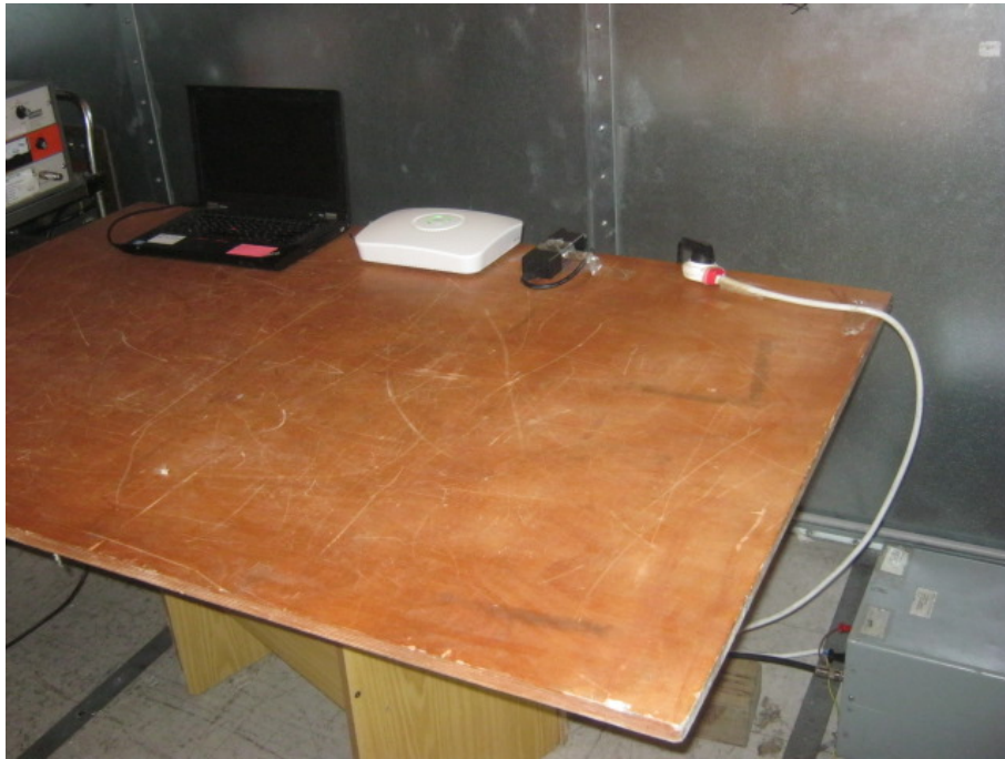
Conducted Emission from AC Line Test