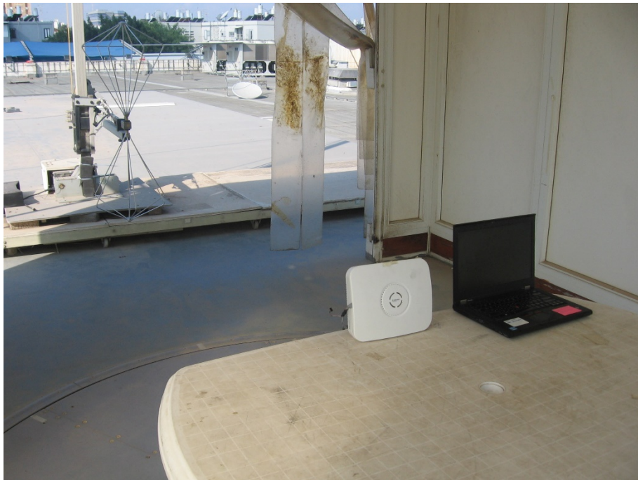
Radiated Emission Test, 30-200MHz