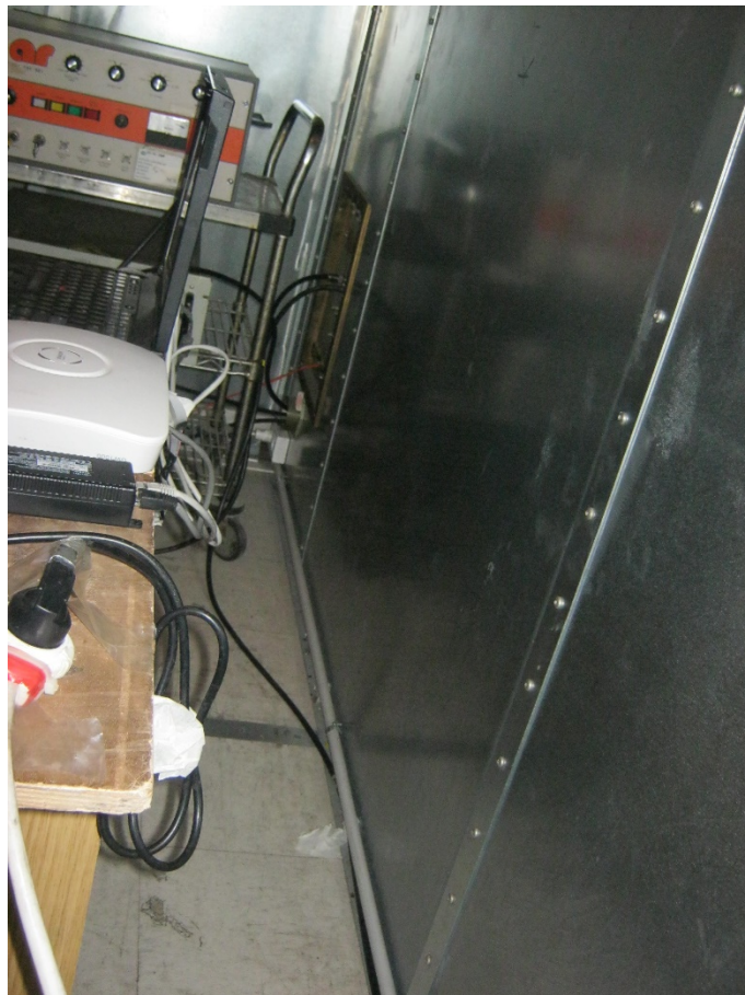
Conducted Emission from AC Line Test