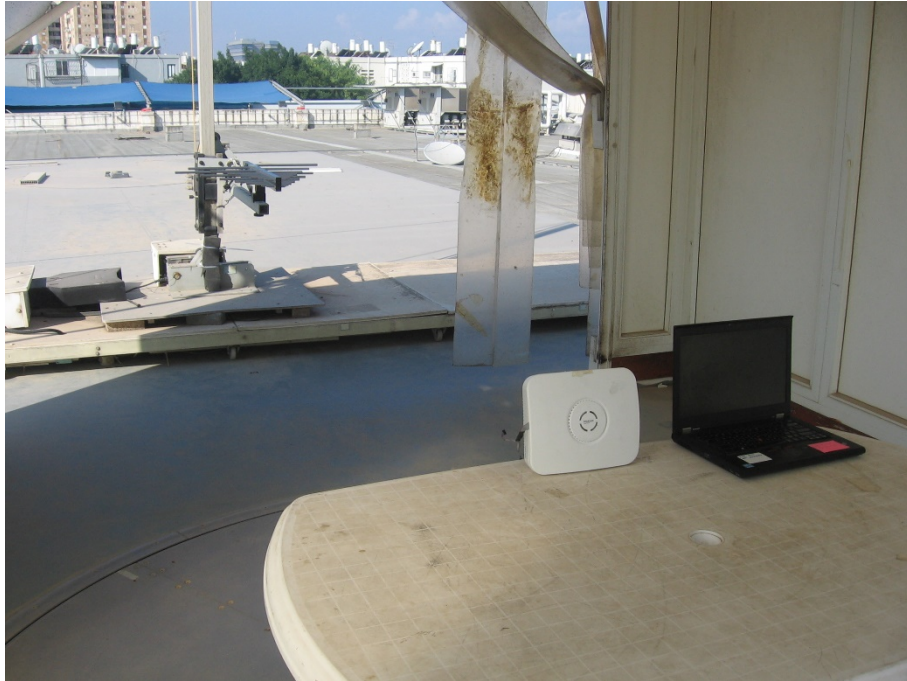
Radiated Emission Test, 200-1000MHz