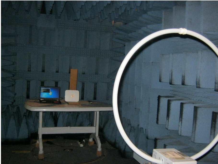
Radiated Emission Test, 0.009-30MHz