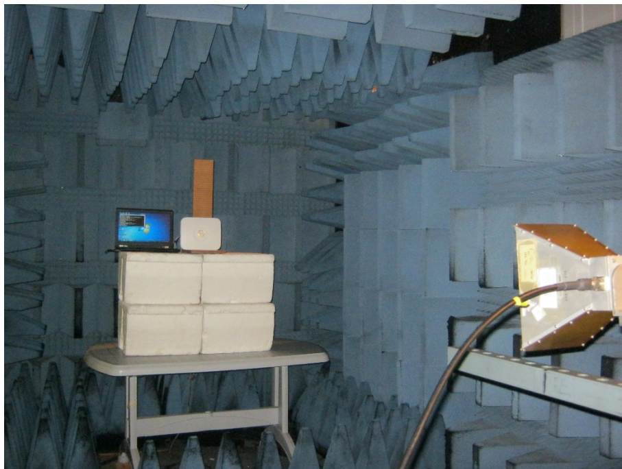
Radiated Emission Test, 1-18GHz