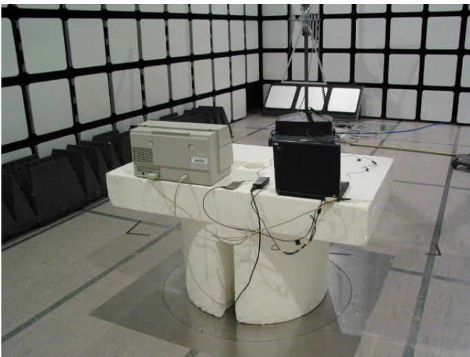
Picture 2 Radiated emission 15B