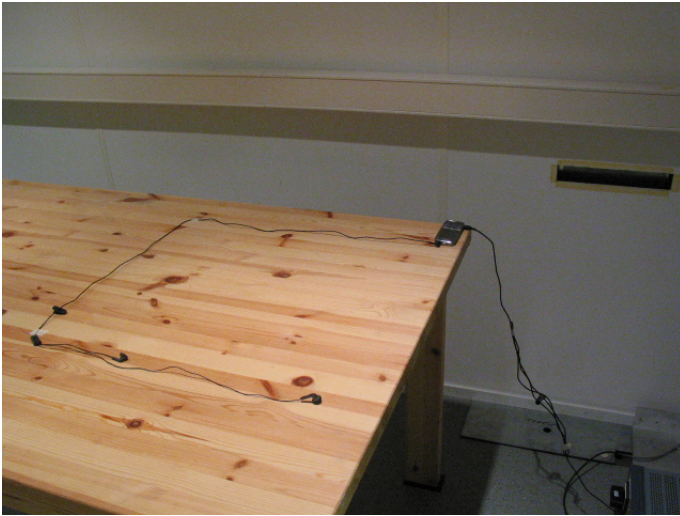
Picture 3 AC powerline conducted emission measurement 15C