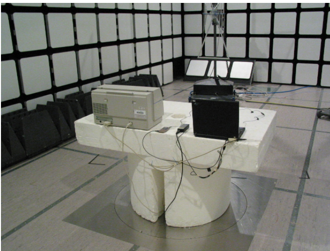
Picture 2 Radiated emission 15B